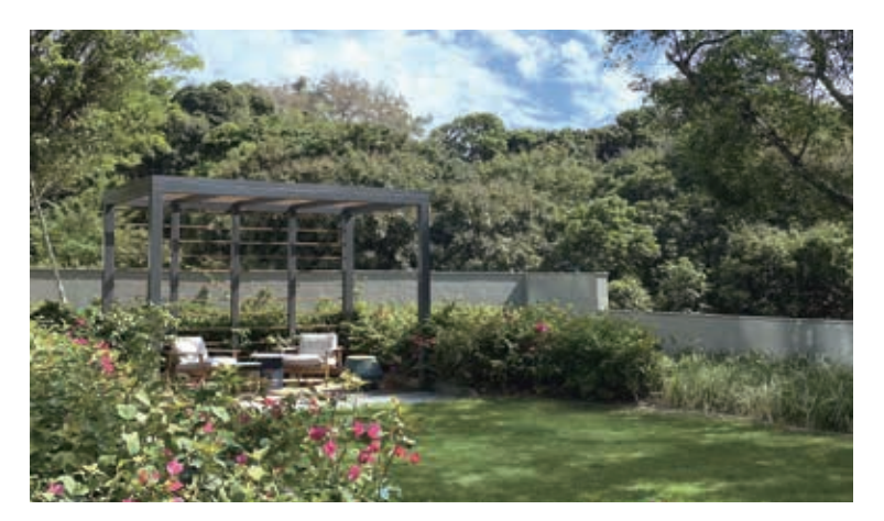
OMA OMA, Tuen Mun, was completed in 2021. 屯門OMA OMA於2021年落成。