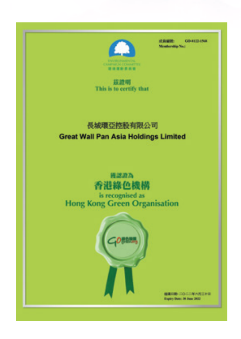
Hong Kong Green Organisation Certificate 「香港綠色機構」證書