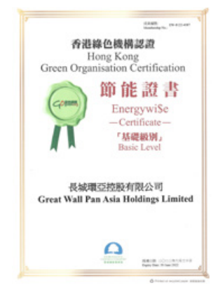
Energywi$e Certificate (Basic Level) 節能證書『基礎級別』

本公司在報告期內,獲得綠色認證機構頒發的「節 能證書『基礎級別』」及「減廢證書『基礎級別』」,肯 定了我們在實踐環境措施的付出和成就。