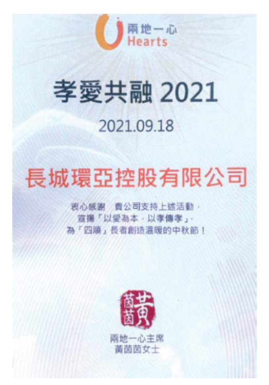
U-hearts President Appreciation Certificate 「兩地一心」主席感謝狀

二零二一年九月十八日,在中秋節日前,本公司 捐贈了300個「福袋」予非營利組織「兩地一心」慈 善機構的獨居長者及低收入家庭,「福袋」內物資 主要包括防疫物資、口罩、及其他日常用品和食 品等,以期為有需要的人士提供實用的援助,共 渡疫情困難期。