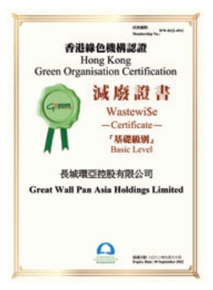
Wastewi$e Certificate (Basic Level) 減廢證書『基礎級別』