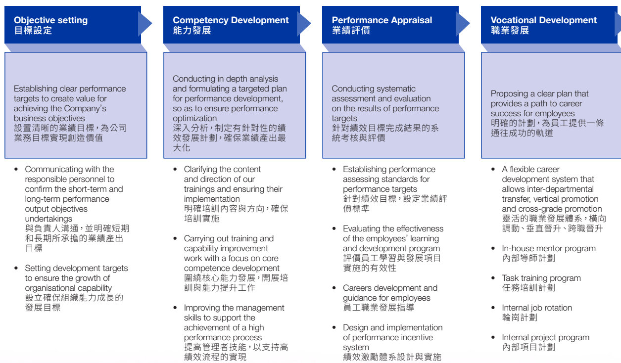
Efficient process for talent development 高效的人才發展流程

本集團嚴格遵守有關禁止童工及強制勞工之有關法律及法規。本集團嚴格禁止僱傭任何16歲以下的員工。本集團人力資源部門與候選人簽署正式僱傭協議前會嚴格執行如核查每個員工的身份證、技能證書及畢業證書等措施，防止任何違規行為。如發現任何年齡、身份及／或就業狀況不合規情況，本集團將立即終止僱傭，並向有關當局報告該事件。在回顧年內，本集團遵守所有與僱傭有關的適用法律和法規。本集團亦採取措施重新確認新招聘員工是否符合徵聘標準。根據政府規定，於試用期內，本集團將支付之每月最低薪金不低於地方政府規定之標準。本集團將根據職位之技能及技術要求釐定員工薪金。