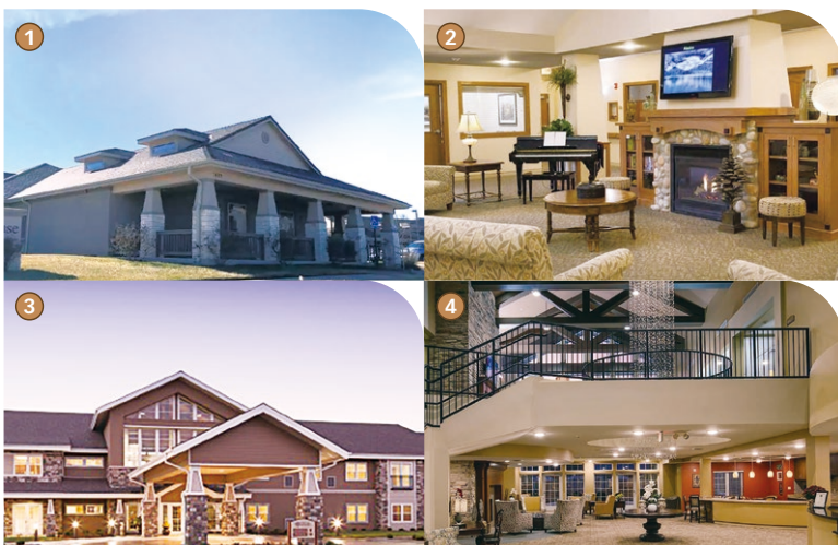
1&2. Glen Carr House, senior housing community

本集團透過其於美國之附屬公司AHR收購了兩套長者住房宿舍（一套位於德克薩斯州、一套位於堪薩斯州），面積合共約98,700平方呎。本集團亦在加州擁有約273,200平方米之永久業權地塊，並在紐約華爾街擁有兩個公寓住宅單位。