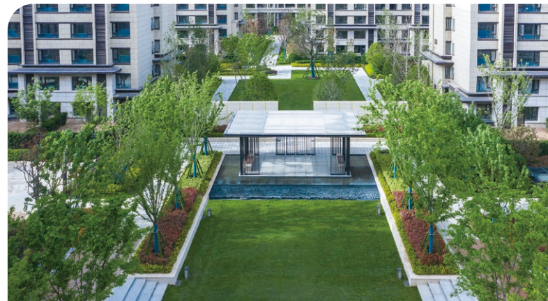
Zhengzhou Zensun River Valley 鄭州正商河峪洲