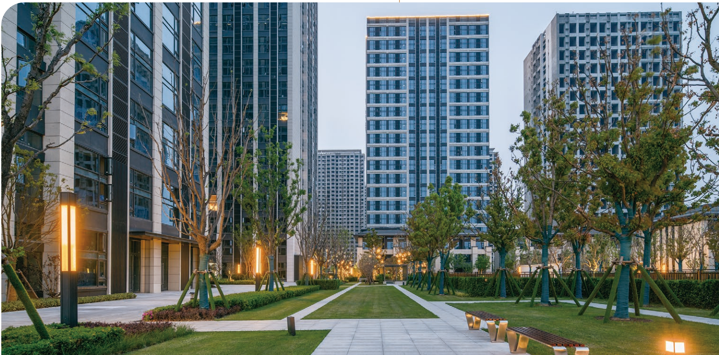
Zhengzhou Zensun Voyage Mansion 鄭州正商匯航銘築

回顧集團2021年的發展，可以用「卓有成效，亮點紛呈」來概括。首先，一年來，本集團全面開展「精益求精、細部細節」專項行動，堅持精益求精化施工，認真把控細節細部，眾多上境系、品質家系列，以及高端商辦項目的品質有目共睹，得到了市場和客戶的讚譽。其次，通過實行提升改造組織架構和人員配置，優化考核制度，進一步增強了員工隊伍的凝聚力、戰鬥力。第三，通過從設計、施工、運營、招采、行銷、行政管理等環節入手，精打細算，勤儉節約，進一步優化了各類成本、提升了運營效率。第四，通過合理安排資金使用和整體降負債，有效降低了資金風險，進一步提升了公司運營的安全性和穩健度。第五，積極落實輕資產運營戰略，投放更多資源進一步擴大物業管理業務，全年新簽約物業管理項目12個，簽約面積2.06百萬平方米，輕資產業務快速鋪開。