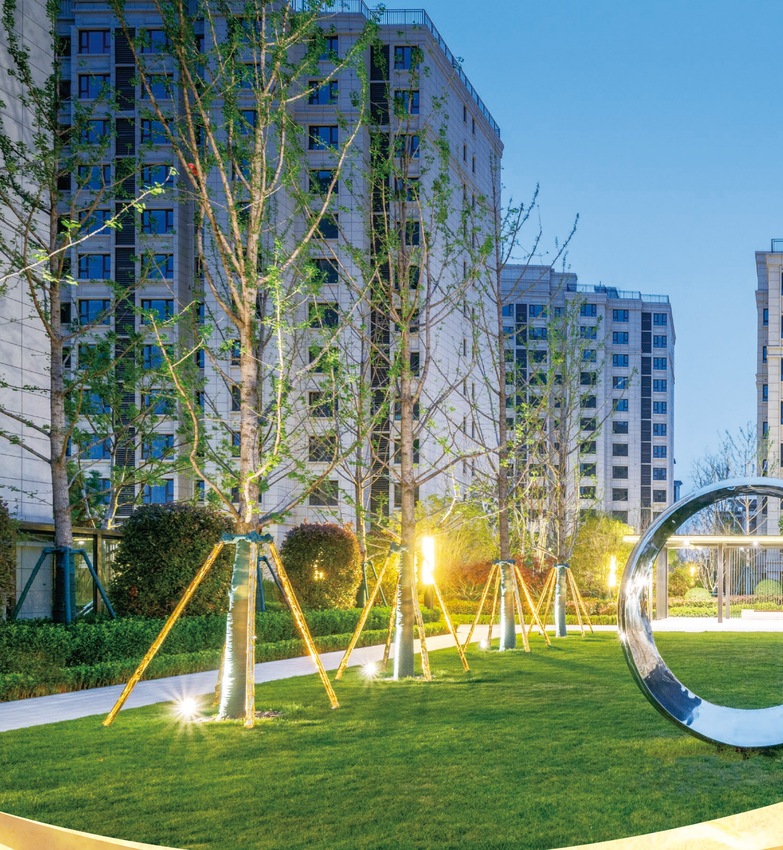
Zhengzhou Zensun Princess Lake 鄭州正商公主湖