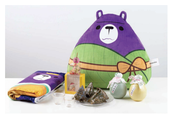
Dragon Boat Festival Gifts

Mobvista provides competitive benefit programs and wellness resources that go above and beyond the legal requirement. We offer diverse benefits and welfares to our employees including onboarding gifts, three meals, afternoon tea, regular health consultations, holiday benefits, paid holidays, and talent apartments. Meanwhile, Mobvista has provided a work area, fitness zone, recreation area, coffee corner and book corner to maintain employees' mental health while they are busy in work.