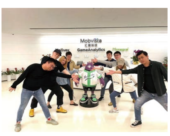
8th year Anniversary Party