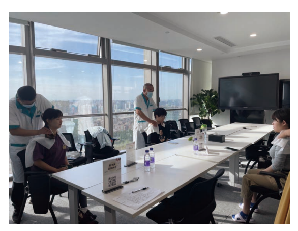
Shoulder and Neck Physiotherapy Activity

In 2021, we further improved our employee well-being and promoted a healthy working environment by providing shoulder and neck physiotherapy services. The physiotherapy we provided alleviates our employees' back and shoulder pains, and prevents work-induced frozen shoulder, cervical spondylosis and any related occupational diseases.