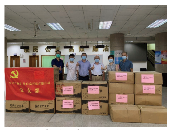
Shadong Street Donation

The COVID-19 pandemic forced many members in our community to face tremendous life changes, e.g. job loss, financial problems and loneliness. There is no doubt that this causes tremendous mental and physical stress. In hopes of sharing warmth and helping our community in this difficult time, we organized a mass donation of sanitary products at Shadong street, Liede street, Zhuji street, Tangxia street and Changxing Street in the Tianhe District (Guangzhou). The Group has donated a total of 12,000 N95 masks, 2,000 face shields, 370 boxes of distilled water and 30 tents.