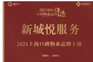
2021上海口碑物業品牌十強 2021 Top 10 Property Management Brands with Excellent Reputation in Shanghai