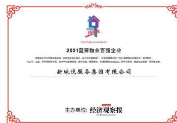
藍籌物業百強企業 Blue Chip Top 100 Property Management Companies