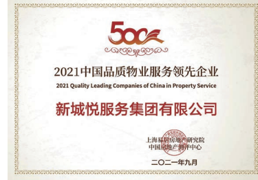
2021中國品質物業服務領先企業 2021 Quality Leading Companies of China in Property Service