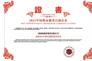
2021中國紅色物業優秀企業 2021 Excellent Red Property Management Company in China