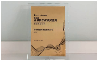
金港股最佳物業公司 Golden Hong Kong Stock - Best Property Management Company