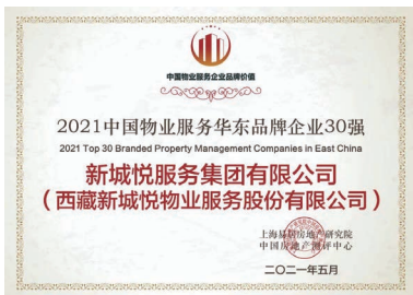
2021年中國物業服務華東品牌企業30強 2021 Top 30 Branded Property Management Companies in East China