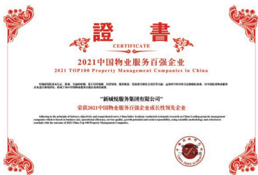
2021中國物業服務百強成長性領先企業 2021 TOP100 Growth-Leading Companies in Property Service