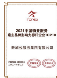
2021中國物業服務雇主品牌影響力標桿企業TOP10 2021 Top 10 Role Model Companies of Property Service with Influential Employer Brand in China