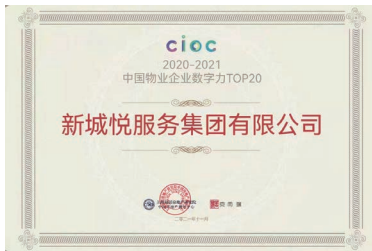
中國物業企業數字力TOP20 Top 20 Digital Capability of Property Services Companies in China