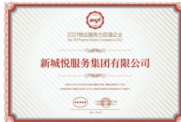
2021物業服務力百強企業 2021 Top 100 Property Companies with Service Capability