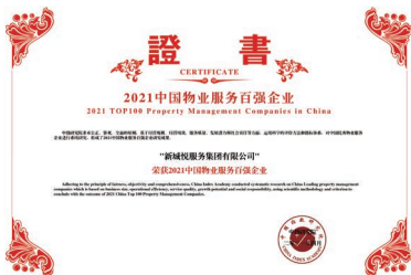
2021中國物業服務百強企業 2021 Top 100 Property Management Companies in China