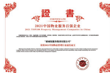
2021中國物業管理行業最佳雇主 2021 Best Employer in Property Management Sector