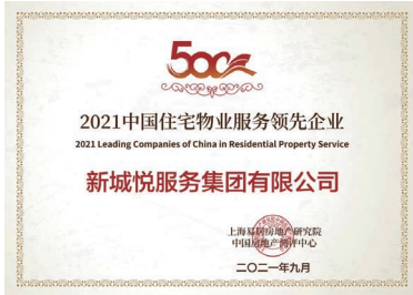
2021中國住宅物業服務領先企業 2021 Leading Companies of China in Residential Property Service