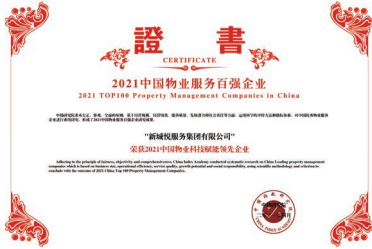
2021中國物業科技賦能領先企業 2021 Leading Property Management Companies in Technology Empowerment