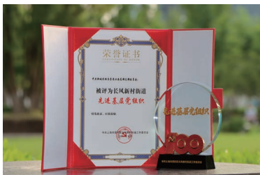
先進基層黨組織 Advanced Grassroots Party Organization