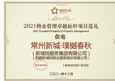
服務力標桿項目-璞樾春秋 Role Model Project of Service Capability-Puyue Chunqiu