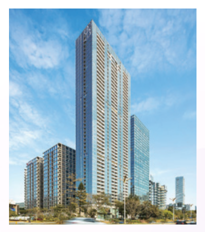
Shenzhen Qiaochengfang Luxury Courtyard