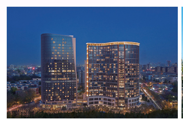
Beijing Nogin Courtyard