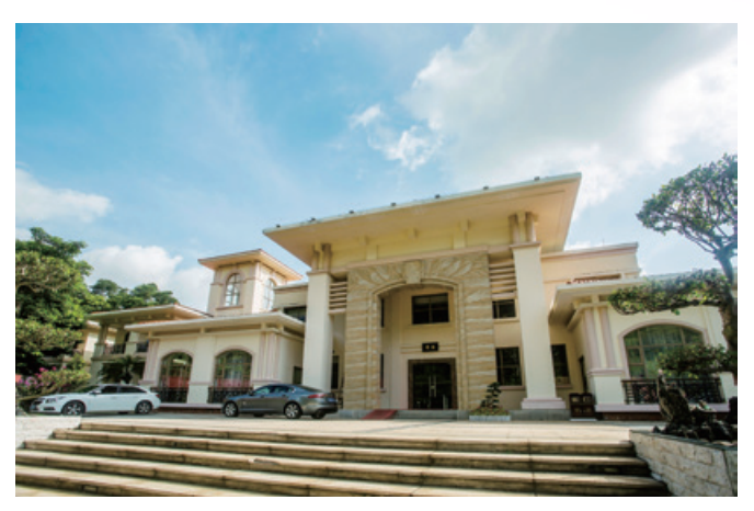
Shenzhen Silver Lake Villa Courtyard

In 2021, Aidigong postpartum care centres through four new courtyards offered services with a wide coverage of properties, including "independent parks, hotels, hotel apartments, pure apartments and holiday garden villas". Among them, the property leased by Shenzhen Qiaochengfang Luxury Courtyard is a five-star hotel apartment. For Shenzhen Flower Township Courtyard, the leased property is a five-star hotel and apartments. Chengdu Concept II Courtyard leased a medical complex and Beijing Nogin Courtyard leased a five-star hotel. The multi-property model provides customers with more choices for environment.