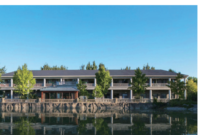
Beijing Villa Courtyard