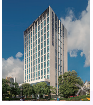
Shenzhen Flower Township Courtyard