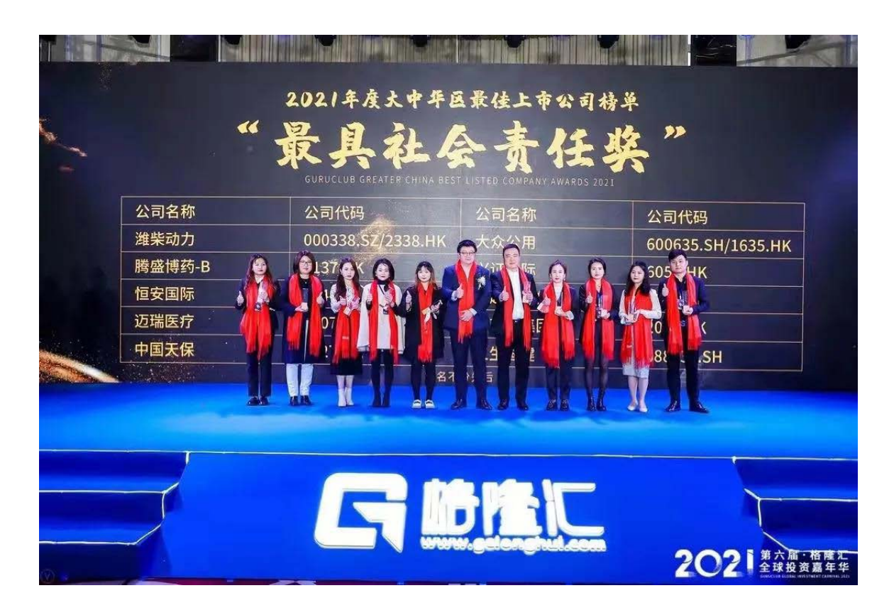
The Group was Awarded the "Best Social Responsibility Award" of the Year for Listed Companies during the Reporting Period

The Group upholds its mission of "nurturing excellent individuals for the future of our country", supports the development of social welfare undertakings and procures students to participate in social activities. The Group strictly abides by the Charity Law of the People's Republic of China and other laws and regulations, gives full play to its own educational and resource advantages, conveys goodwill, and has formulated relevant policies to clarify the provisions on charity to ensure that its donations and sponsorships are used properly. During the Reporting Period, the Group invested RMB360,000 in community public welfare undertakings, and won the "Best Social Responsibility Award for Listed Companies of the Year" in the "Global Investment Carnival 2021" in the People's Republic of China, the "Advanced Anti-pandemic Group for Private Education in Yuexiu District" and the "Golden Spike Partner of Education Charity" as well as other awards, reflecting the Group's outstanding performance in social responsibility.