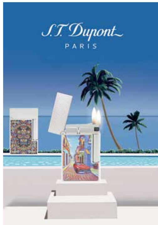
S.T. Dupont 'Mexico and Havana Collection' Ligne 2 Cling lighters. 「都彭」的「Mexico and Havana Collection」 Ligne 2 Cling打火機。