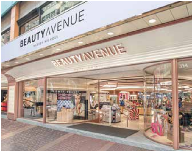
Newly opened Beauty Avenue flagship store at Bank Centre, Mongkok. 「位於旺角銀行中心新開設的「Beauty Avenue」旗艦店。」