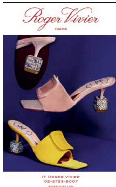
Shoes by Roger Vivier. 「Roger Vivier」鞋履。