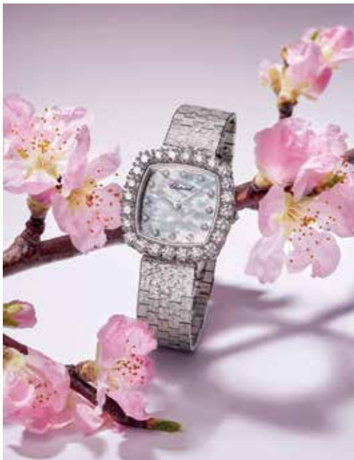
Chopard 'L'HEURE DU DIAMANT' watch. 「蕭邦」的「L'HEURE DU DIAMANT」腕錶。

Geographically, Hong Kong contributed 72.2 per cent. of sales, Taiwan 22.8 per cent. and other territories 5.0 per cent..