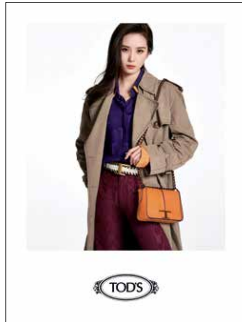
Handbag by Tod's. 「Tod's」手袋。