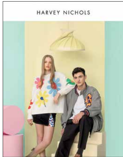
Fashionwear at Harvey Nichols. 於「Harvey Nichols」的時裝。

The Group adopted the most conservative approach in managing its retail network. Today, the Group's retail network totals 60 stores, comprising 7 stores in Hong Kong, 30 in China and 23 in Taiwan.