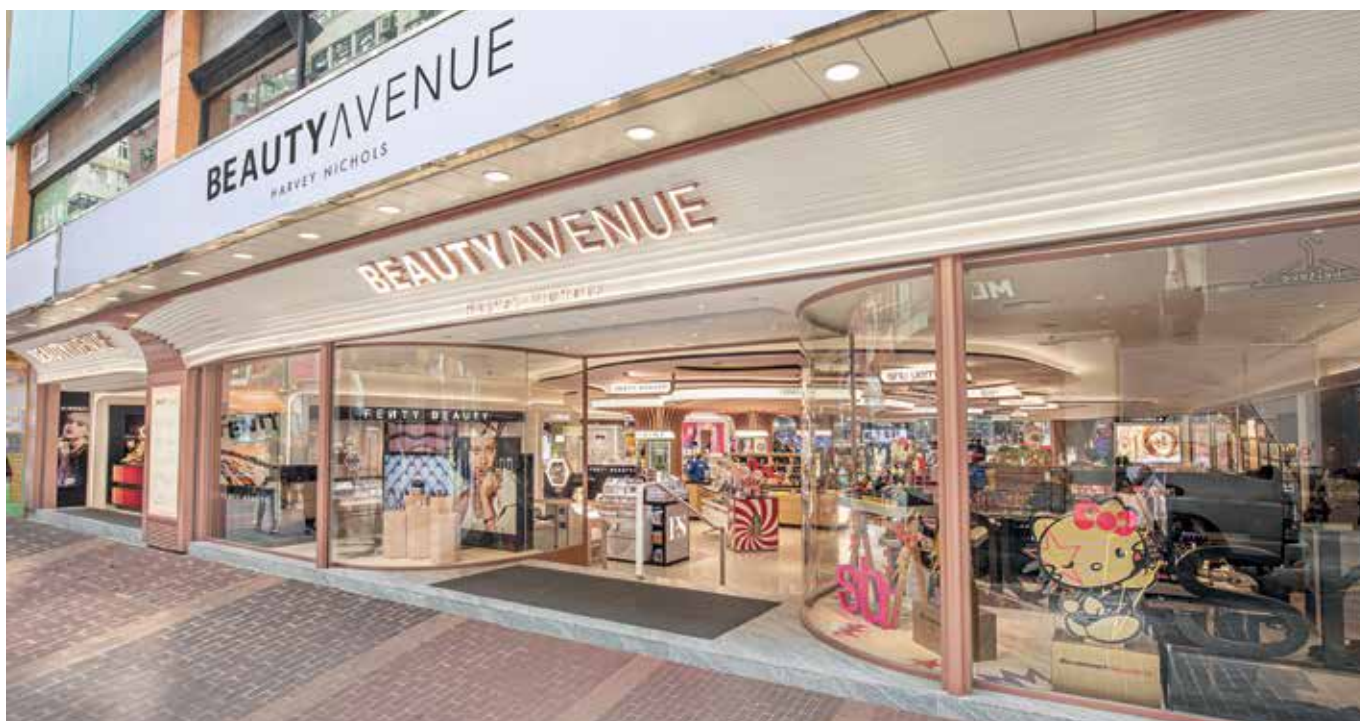
New Beauty Avenue flagship store at Bank Centre, Mongkok opened by the Group during the year.