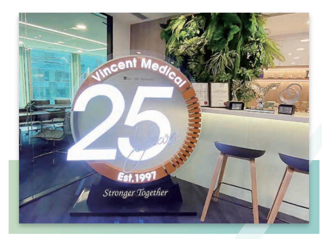
May 23, 2022 marked 25 years of helping lives!

A kick-off ceremony was broadcasted live on May 23, 2022 to mark the launch of the 25<sup>th</sup> anniversary celebrations and to celebrate this milestone with the Group's associates in Hong Kong, Mainland China, Japan, the US and Europe.