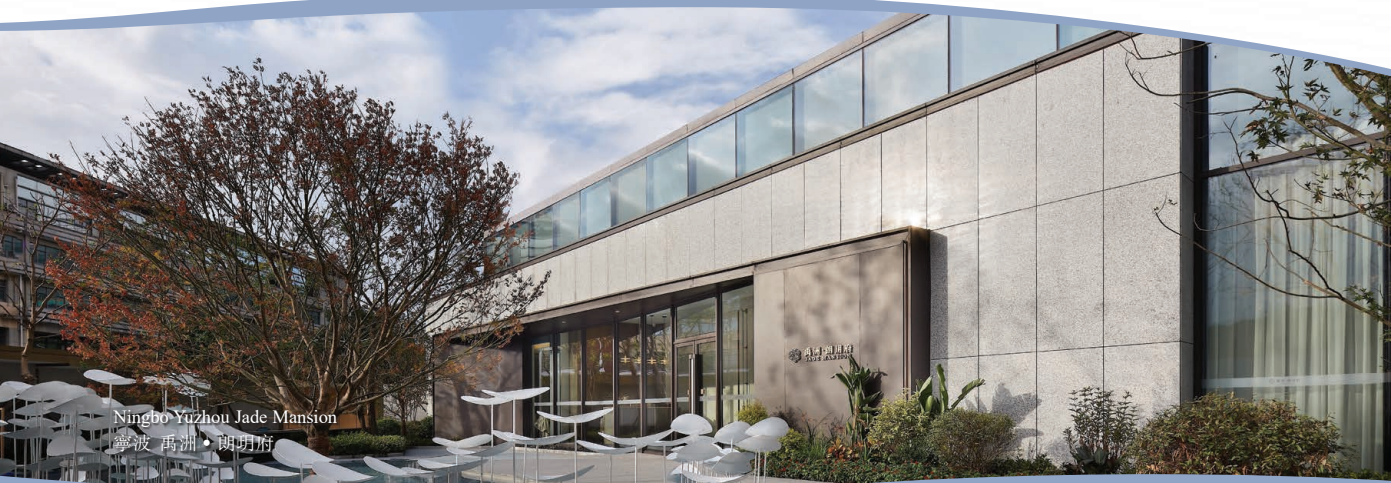
Ningbo Yuzhou Jade Mansion 寧波 禹洲·朗明府

As at June 30, 2022, the Group provided guarantees to banks amounting to RMB23,839.26 million (December 31, 2021: RMB18,234.88 million) in respect of mortgage facilities granted to certain purchasers of the Group's properties. The amounts of guarantee to banks and other lenders by the Group in respect of facilities granted to joint ventures and associates were RMB2,527.82 million (December 31, 2021: RMB2,382.34 million) and RMB684.25 million (December 31, 2021: RMB471.71 million), respectively. The amounts of guarantee to banks and other lenders by the Group in respect of facilities granted to certain contractors for construction cost were RMB7.06 million (December 31, 2021: RMB8.95 million). The amounts of guarantees to banks and other lenders in respects of facilities granted to independent third parties, net of the principal and interest of RMB2,671.37 million (December 31, 2021: Nil) included in the Group's interest-bearing bank and other borrowings, were RMB1,796.27 million (December 31, 2021: RMB4,226.35 million). The Group provided guarantees to banks and other lenders in respects of facilities granted to independent third parties amounting to RMB4,467.64 million (December 31, 2021: RMB4,226.35 million).