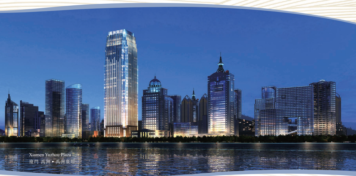
Xiamen Yuzhou Plaza 廈門 禹洲·禹洲廣場