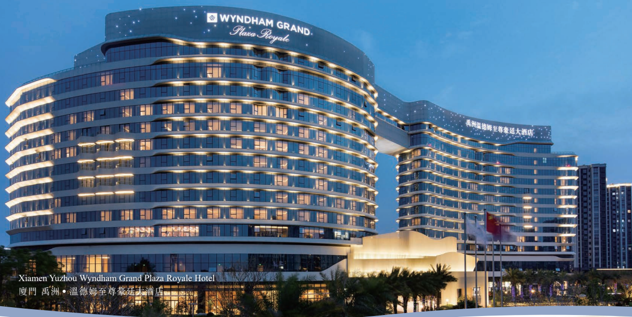
Xiamen Yuzhou Wyndham Grand Plaza Royale Hotel 廈門 禹洲·溫德姆至尊豪廷大酒店

期內，本集團的收入為人民幣123億9,309萬元。於2022年上半年，利潤為人民幣3億5,259萬元。總權益達人民幣406億4,169萬元。董事會不建議派發截至2022年6月30日之中期股息。