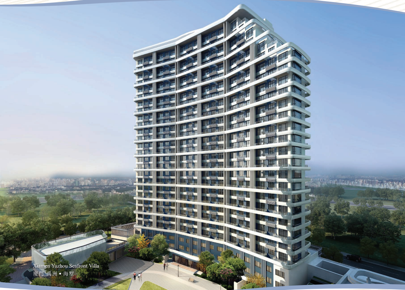
Xiamen Yuzhou Seafont Villa 廈門 禹洲·海墅

截至2022年6月30日止，本集團總銀行及其他借貸、公司債券及優先票據，合共約人民幣545億7,985萬元中，約有24.41%為人民幣計值及75.59%為港元及美元計值。