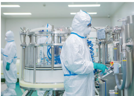
ADC Production Facility

In 2020, as our ADC product TAA013 entered into Phase III clinical trial, TOT BIOPHARM set up a commercial production platform for ADC at its headquarters in Suzhou Industrial Park, thereby building a complete industrial platform that covers drug research and development, pilot test process, clinical production through commercial production. The Company has already built a complete GMP-compliant ADC commercialization production workshop that can produce ADC naked antibodies, drug substances and drug products, which is scarce in mainland China. The workshop is equipped with OBE-5 grade isolators, enjoys advanced coupling core technology and ADC analysis technology advantages, and has high standard quality management system and GMP-compliant commercialization capability. In addition, TOT BIOPHARM is actively constructing its ADC commercial capacity, with a designed annual production capacity of ADC pilot and commercial production workshop of 60,000g, where all key production processes of ADC can be completed within the same production base, thus fulfilling the need for different production scales for small trials, pilot tests and commercialization. Apart from having flexible and diverse production capacity, the production platform also makes supply chain management and risk management and control easier, resulting in better control over time, cost and risks.