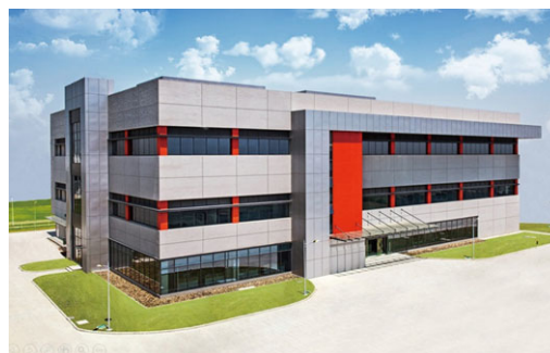
mAb and ADC Drug Production Base that Meets International Standards

The Company has developed its business in Suzhou for more than a decade, and has already built a large-scale biopharmaceutical production base that complies with GMP standards and employs production equipment that meets high international standards. The production base is designed for flexible production and has sufficient capacity to meet the demand of different scales of production for small trials, pilot tests and commercialization. In response to the development and changes of the industry, TOT BIOPHARM has made the most of its competitive advantages and actively expanded its CDMO business, aiming to lay a solid foundation for the Company's long-term development and create diversified income. The continuous expansion of commercial production capacity has laid a solid foundation for the commercial production of our self-developed products and CDMO business development.