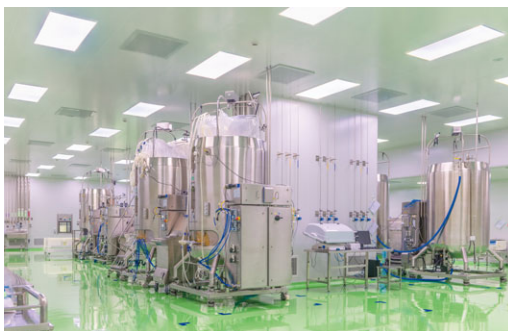
Cell Culture Room

In the first half of 2022, TOT BIOPHARM continued to expand its commercial production capacity, improve the comprehensive capabilities of its ADC commercial production platform, and successfully completed the renovation of its ADC pilot production workshop. At the same time, it actively promoted the construction of the second ADC drug products commercial production line and ADC drug substances pilot production line.