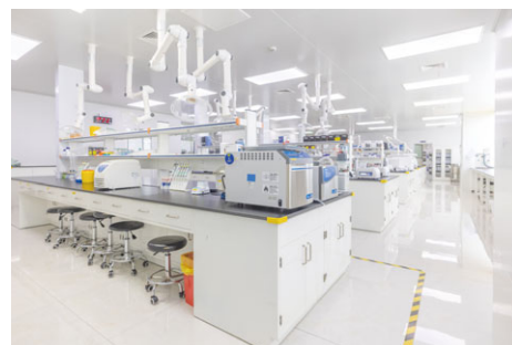
Quality Control GMP Laboratory

TOT BIOPHARM has established a complete ADC analysis technology platform through self-developed products. It enjoys technological advantages of core coupling process and amplification, has the ability to independently evaluate and analyze the key quality attributes of ADC, and has established a comprehensive quality assurance system in compliance with NMPA, FDA and EMA regulations, thus ensuring high-quality production and control of products. At the same time, in order to further strengthen our competitive advantages in the ADC field, we have established a single quality system for the development of the mAb process and the coupling process of ADC drugs. It is equipped with a stable platform that spans from coupling process development to mass production, covering drug development of more than 10 different ADC technologies including process optimization and product quality control, and employs mature production technology incorporating the production experience of 9 ADC projects, including Phase I and Phase III clinical projects.