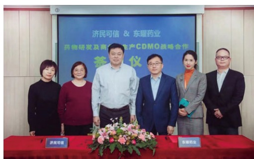
Strategic CDMO Cooperation with Jiangxi Jemincare Group Co., Ltd.

TOT BIOPHARM has firmly grasped market opportunities, with its business covering diversified needs for various products including chemical drugs, mAb drugs and ADC drugs. The Company joins hands with industry partners to accelerate the research and development of innovative drugs so as to satisfy patients' drug accessibility needs. So far, the Company has undertaken different project orders from pharmaceutical companies and R&D biotechnology companies, and has received positive feedback and secured repeat orders from customers. In addition, leveraging on our geographical advantage, we have accelerated the expansion of new customer resources and demonstrated our competitive advantages, and have ushered in a new era whereby our business continued to grow and was highly recognized by investors and partners. In January 2022, TOT BIOPHARM signed a CDMO strategic cooperation agreement with Jiangxi Jemincare Group Co., Ltd. (江西濟民可信集團有限公司) to provide one-stop services that covers drug R&D through commercial production.