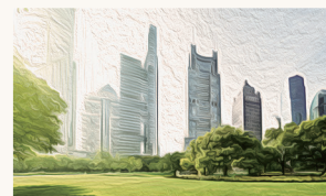
幸福街區 HAPPINESS NEIGHBORHOOD