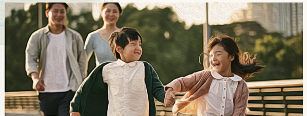
幸福服務 HAPPINESS SERVICE

Happiness π is the "five-dimensional happiness service system" created by Shinsun Property through insight and exploration of the service needs of urban families, adhering to the brand concept of "personalized happiness in every sense", covering five core service contents: happiness tribe, happiness space, happiness community, happiness service and happiness neighborhood, and is dedicated to providing customers with an all-age, all-cycle Shinsun-style happiness life experience