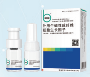
Beifuji Lyophilised Powder