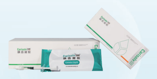
Carisolv<sup>®</sup> Dental Caries Removal Gel