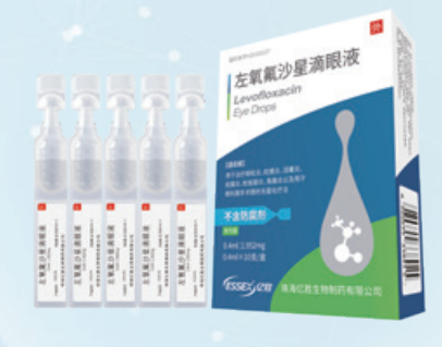
Unit-dose Levofloxacin Eye Drops