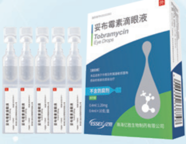
Unit-dose Tobramycin Eye Drops