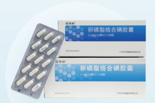
適麗順® (lodized Lecithin Capsules*)