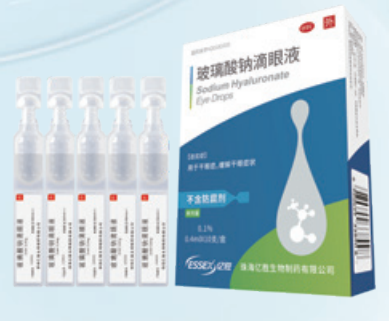
Unit-dose Sodium Hyaluronate Eye Drops