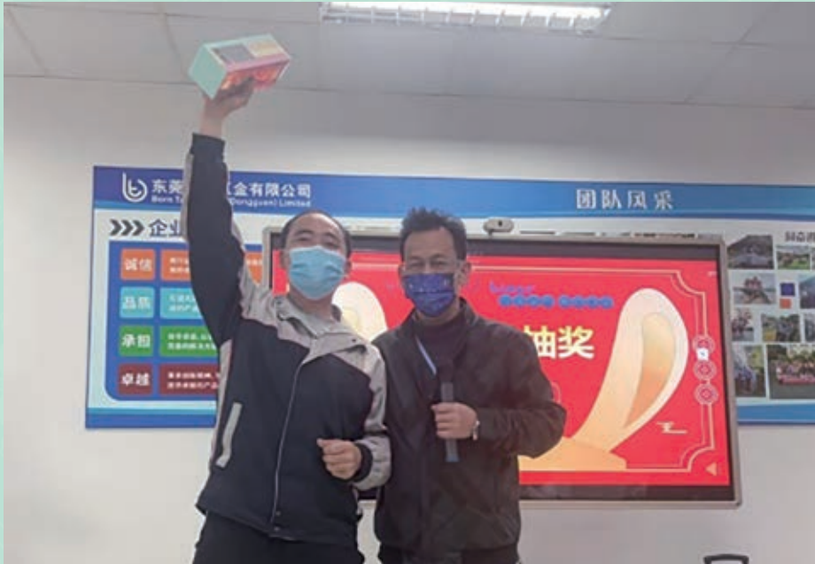
Lucky draw activity of the Group's subsidiary, Dongguan Born Talent 集團下屬東莞生才公司員工抽獎活動