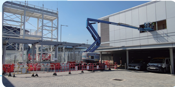
New Integrated Airport Centres — Building and Civil Works IAC Hall