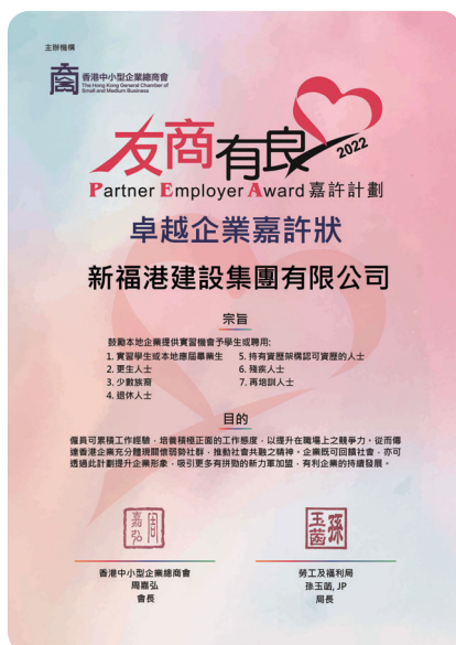
Partner Employer Award 2022 — Certificate of Appreciation (Enterprise) 「友商友良」嘉許計劃 2022 — 嘉許企業嘉許狀