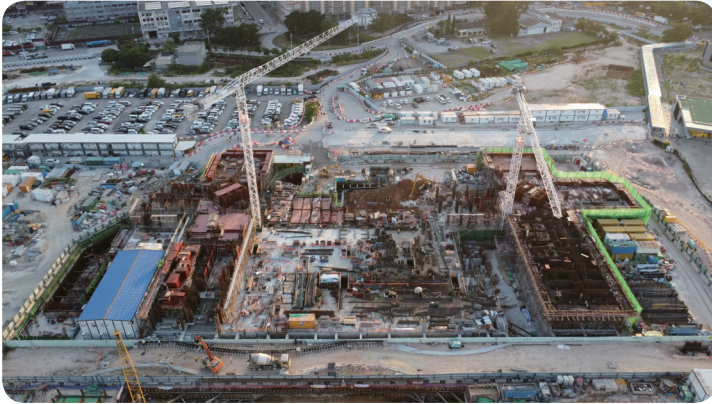
Construction of Public Housing Development at Kai Tak Sites 2B5 and 2B6