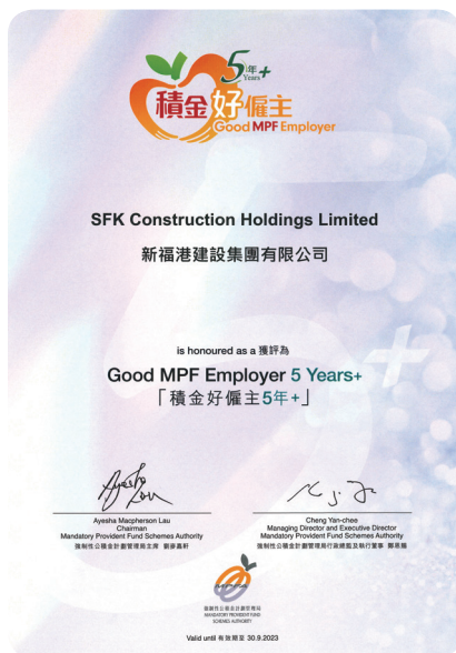
Good MPF Employer 5 Years+ 積金好僱主 5年+