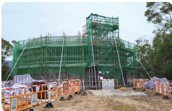
Improvement Works at Tai Tong Nursery Water Tank Construction