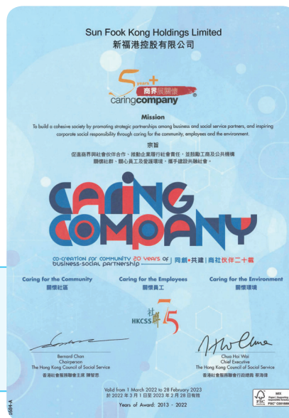
5 years+ Caring Company Logo 連續五年或以上獲頒「商界展關懷」標誌