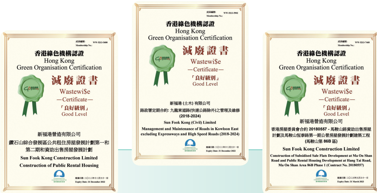
Wastewi$e Certificate — Good Level