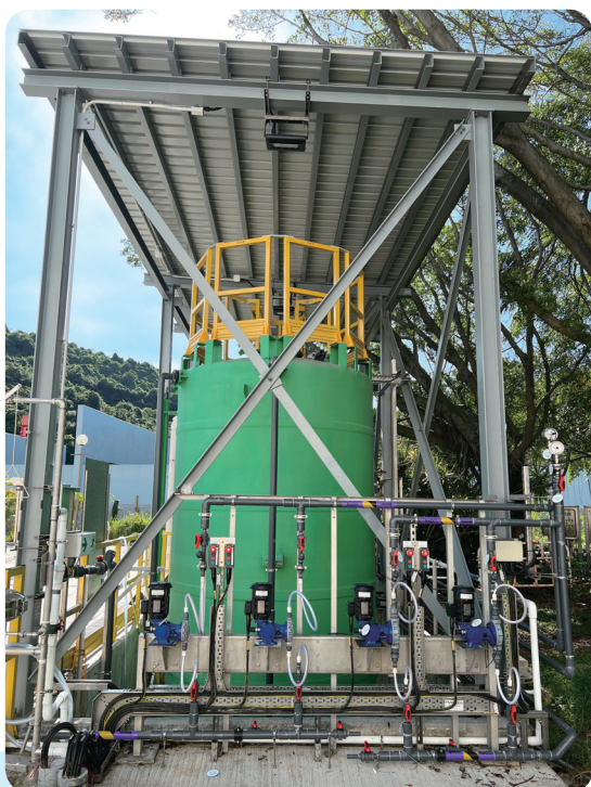
Enhancement of Deodourisation System at Stonecutters Island Sewage Treatment Works