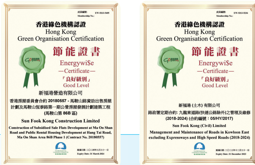
Energywi$e Certificate — Good Level