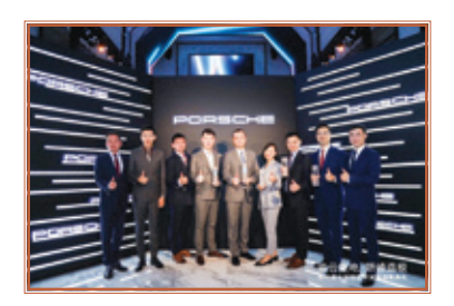
Training courses organized by various brand manufacturers