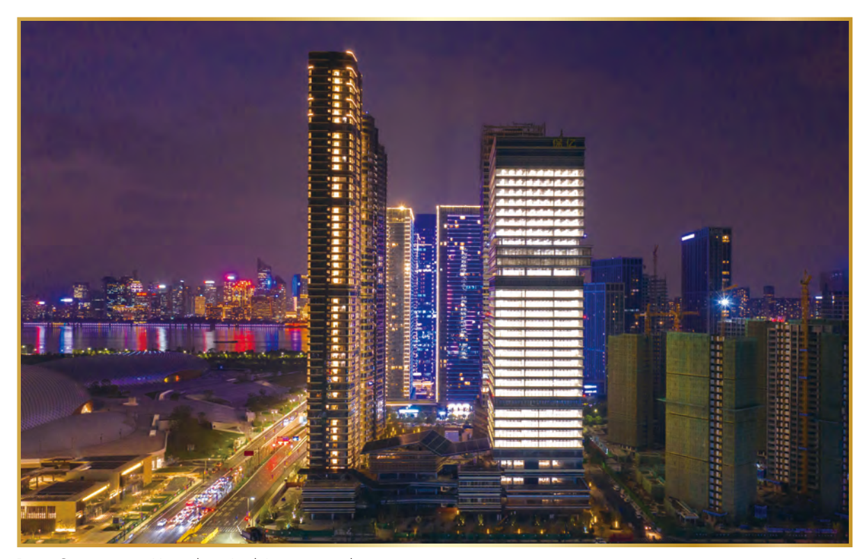
Boee Greentown • Hangzhou Aodi International

As at 31 December 2022, the Group's project management projects were distributed in 120 major cities in 28 provinces, municipalities and autonomous regions in China.