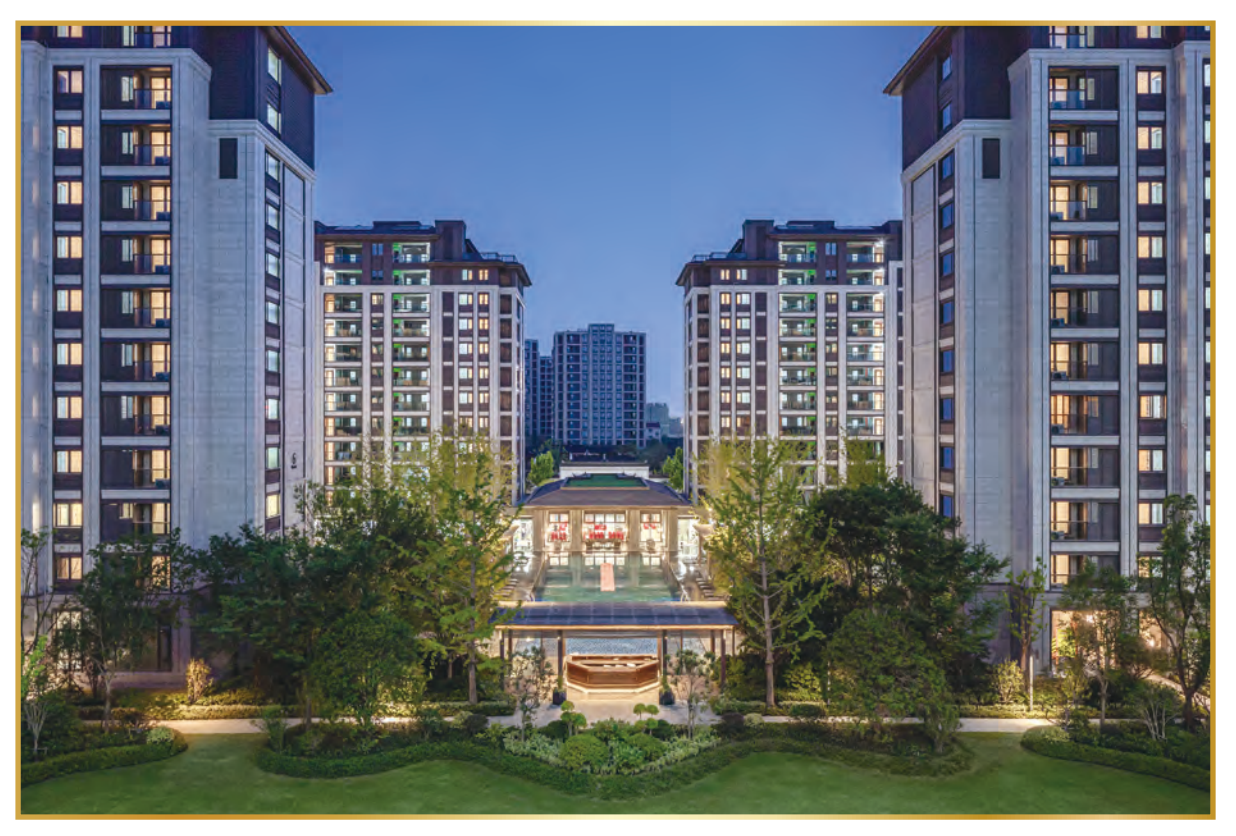
Greentown • Tongxiang Pu Garden

With its first-mover advantages, leading effects and nationwide presence, and on the basis of full assessment of the market, the Company has upgraded its business model, optimized customer structure, focused on regional structure, enhanced the building of capability, continued to improve three main project management operations (government project management, commercial project management and capital owner project management) and three major supporting services (financial services, industrial and urban services, and industrial chain services), as well as provided higher-quality customized services to B-end customers with "Climbing Model (登山模型)" and created better community services for C-end owners with "Fortunate Community".