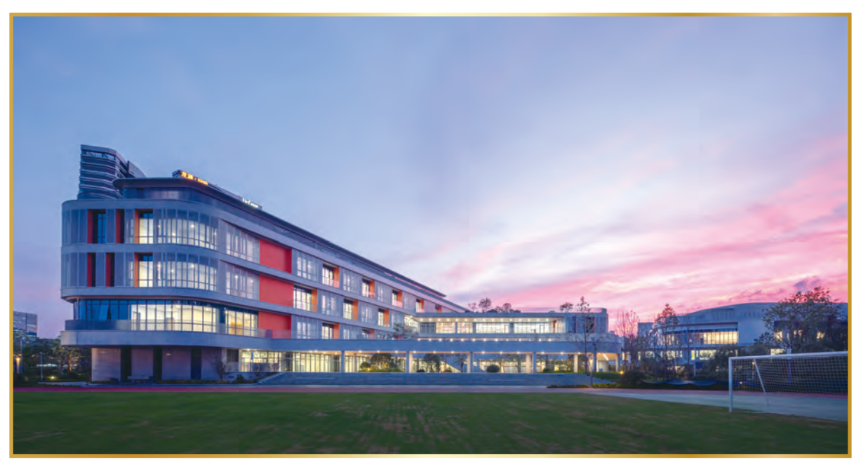
Hangzhou Jianghui Primary School* (杭州市江暉小學)