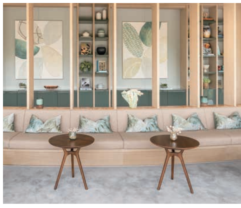
All photos in this annual report were taken at OMA by the Sea, Tuen Mun. The project was completed in 2022. 本年報所有圖片均攝於屯門 OMA by the Sea 。此項目於2022年落成。