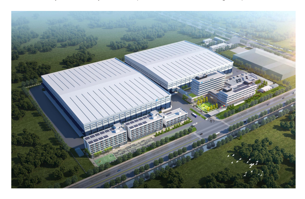
Changshu Manufacturing Base (Design Rendering)

During the Reporting Period, the Group's high-end equipment manufacturing base project of Morimatsu LifeSciences located in Changshu, Suzhou City, Jiangsu Province commenced construction, the first phase of which has an area of approximately 130,000 square meters, and is expected to be delivered and put into operation in the fourth quarter of 2023, achieving an estimated annual sales of RMB2 billion. The project, when put into operation, will be mainly used to provide high-end process equipment and complete sets of equipment of digital intelligence for the biopharmaceutical field, wet electronic chemical field, family care industry and other precision industries with high requirements on cleanliness.