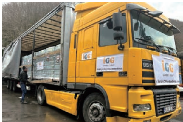
Donating rescue supplies to earthquake-stricken areas