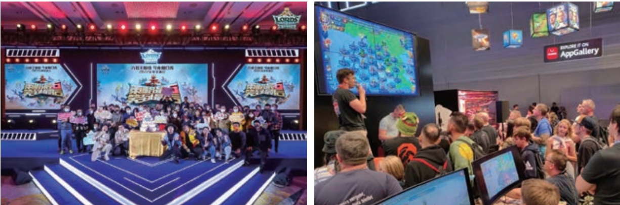
Player Interactive Events

We conduct a variety of interactive events which have been well-received by players. Offline activities include international game tournaments, player gatherings and exhibition at major game shows, which create multidimensional experience and establish exchange communities outside the cyberspace. At the same time, we hold regular online events, including designing contest, talent show, and interactive live streaming. While expanding the influence of our games, these events reach out to players in more channels, enhance player engagement, and promote close connection between players and IGG's games.