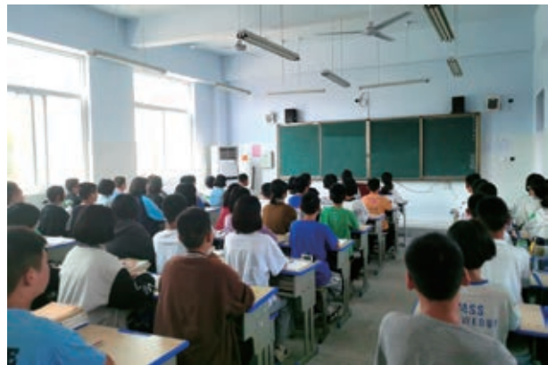
New building of Weihui No.10 Middle School in Henan, China