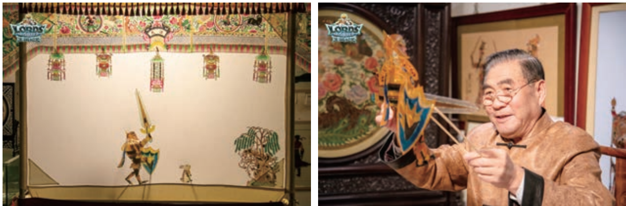
Integrating traditional art elements into games

IGG supports its employees in volunteering activities. Employees initiate a volunteering community and hold regular events, such as charity sales of second-hand items or local produces to raise funds for the less fortunate.