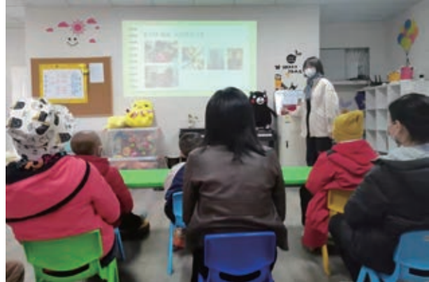
“Hospital Classroom” for children with leukemia