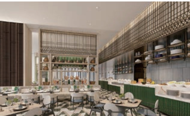
All Day Dining Restaurant at Regal Xindu Hotel (*)