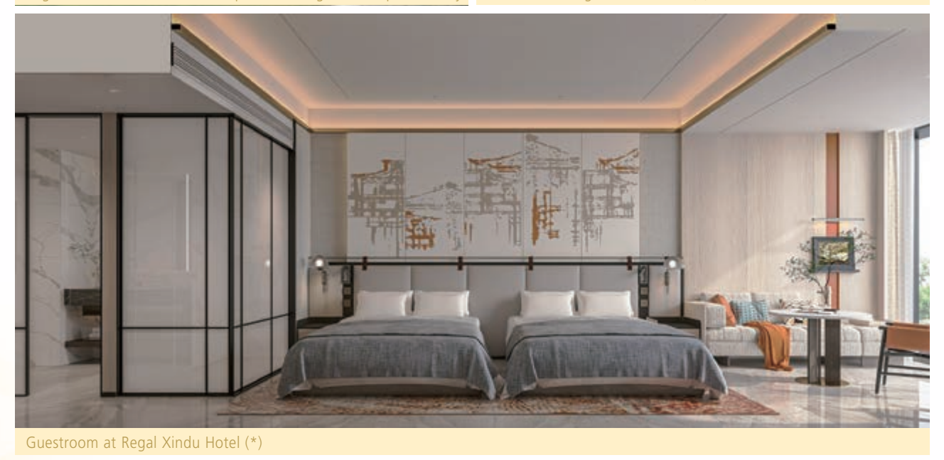
* Artist impression