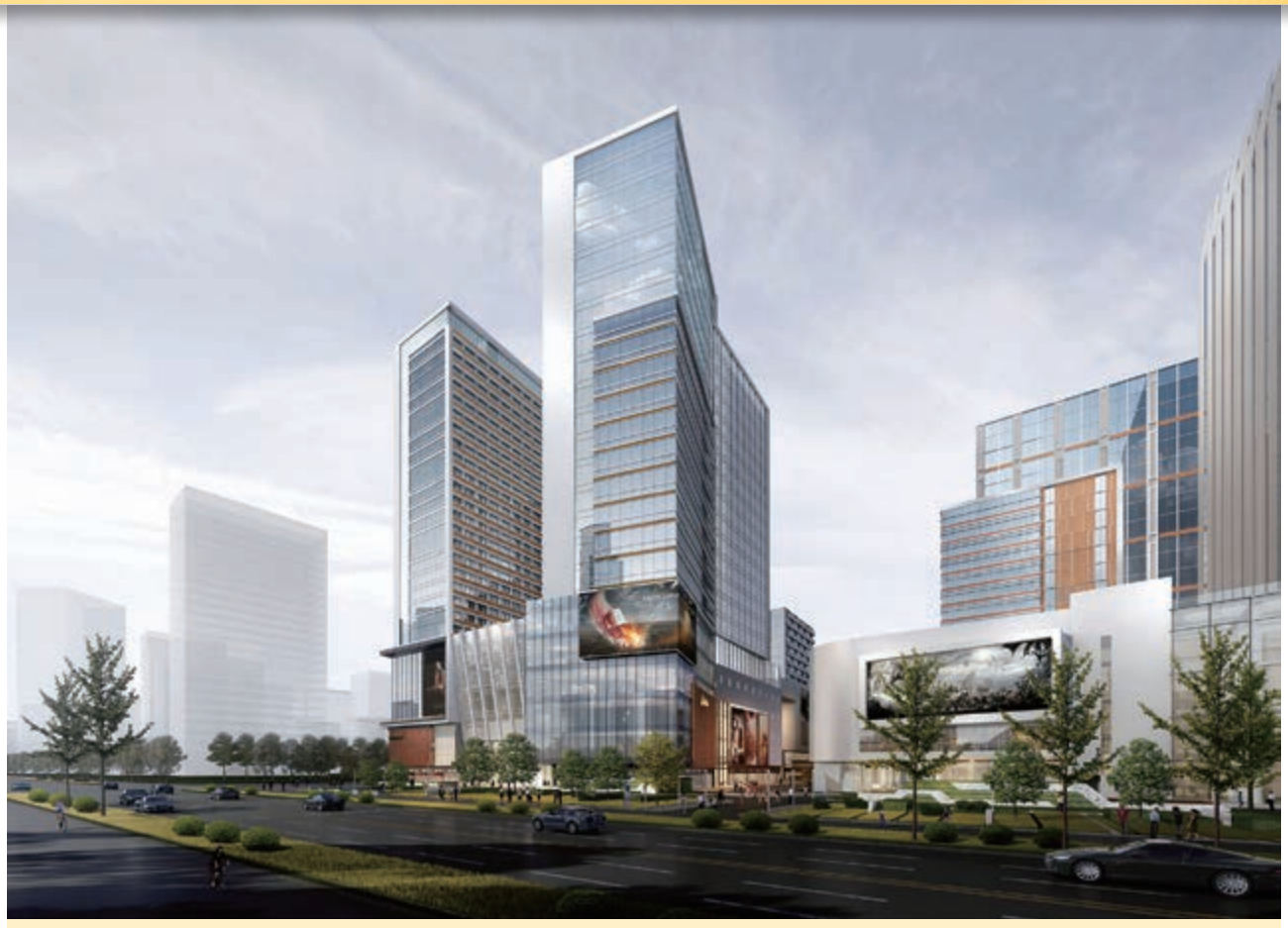
Commercial/office towers of Regal Cosmopolitan City (*)