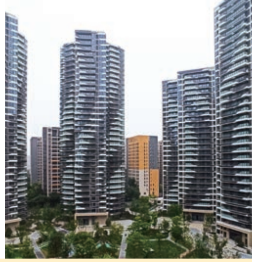
Casa Regalia (Phase 1 and Phase 2), Regal Cosmopolitan City - completed