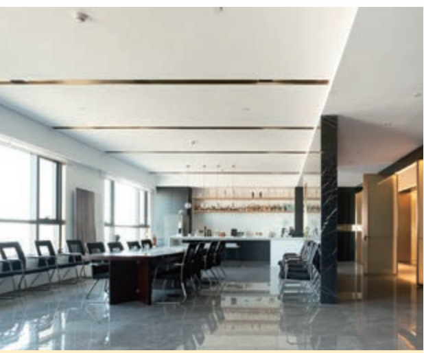
Multi-functional room of an office tower