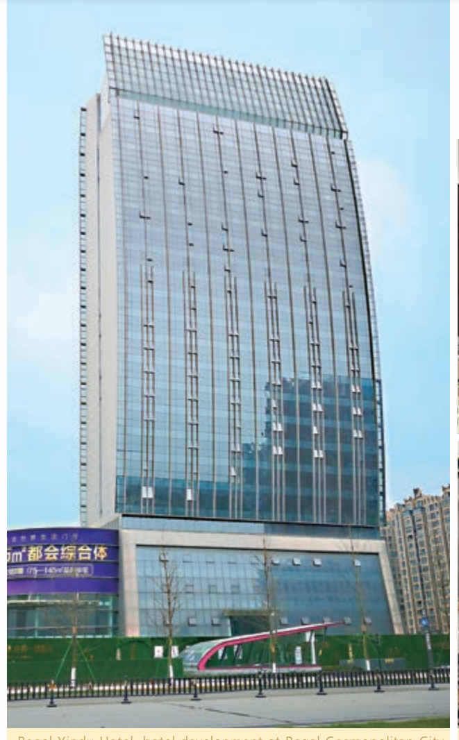
Regal Xindu Hotel, hotel development at Regal Cosmopolitan City