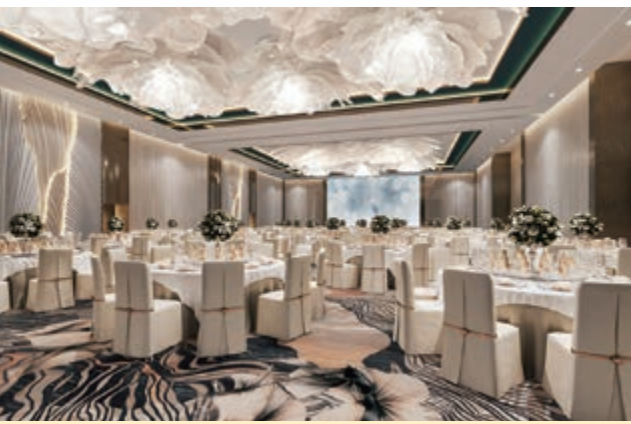
Ballroom at Regal Xindu Hotel (*)