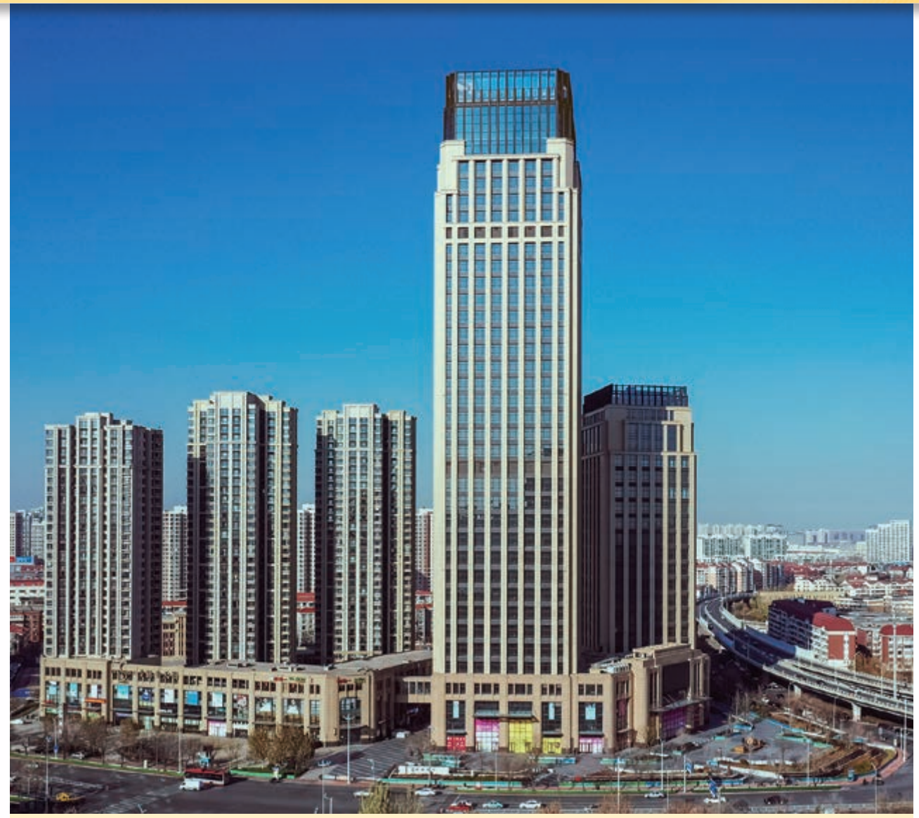
Regal Renaissance, a composite commercial/office/residential development in a prime location of Hedong District, Tianiin