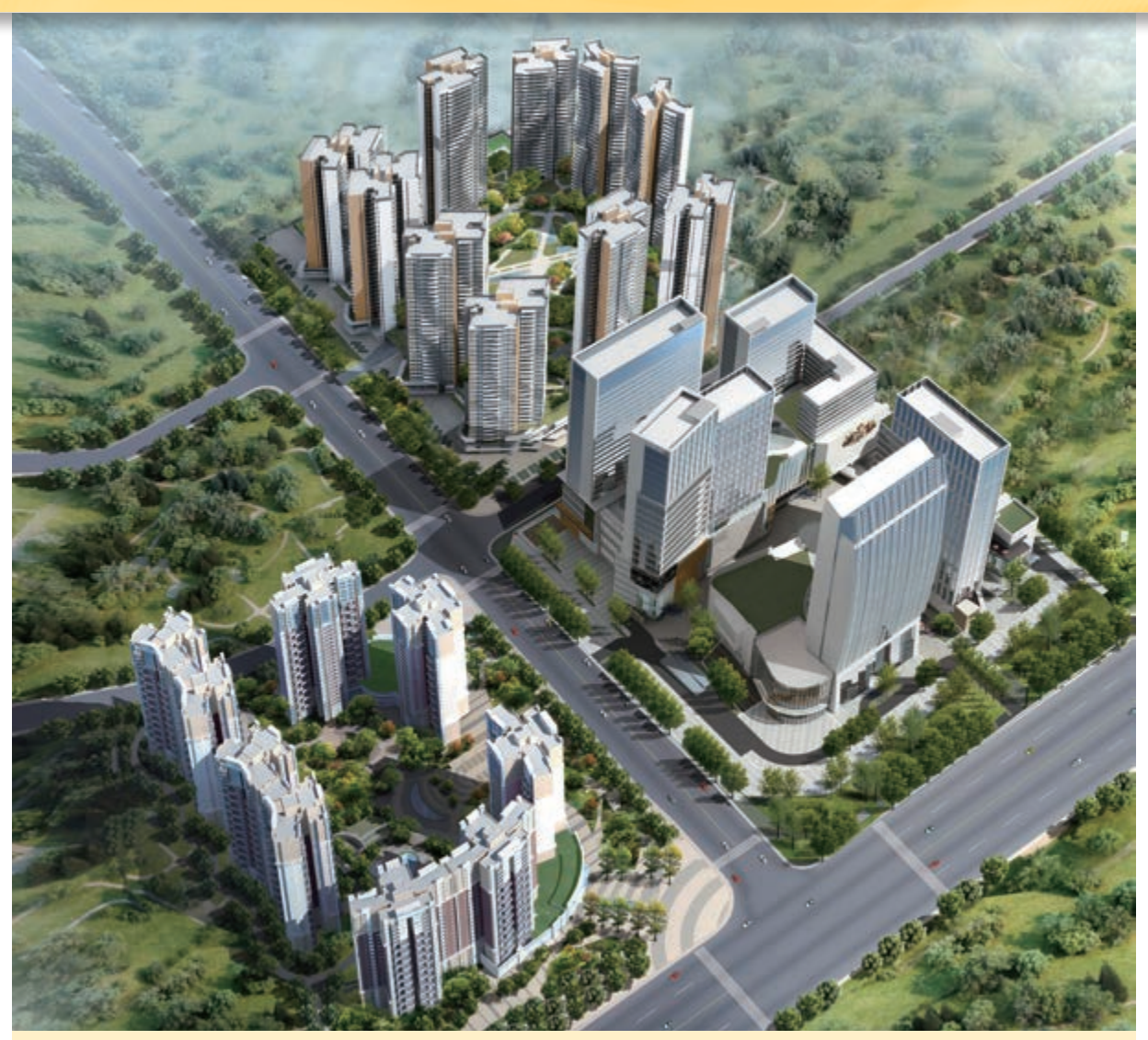
Regal Cosmopolitan City, a composite residential/commercial/office/hotel development in Xindu District, Chengdu, Sichuan (*)