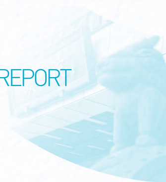
Materiality Matrix of Chen Xing Development