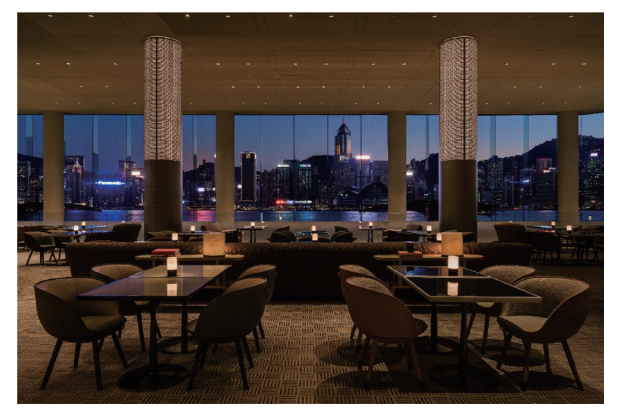
Regent Hong Kong – Lobby Lounge