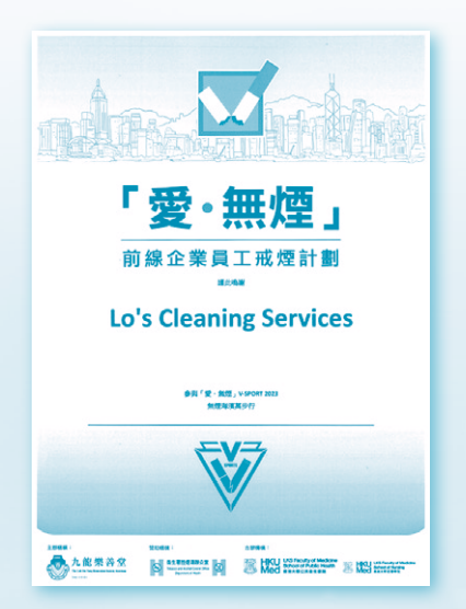
「無煙海濱萬步行」Certificate of appreciation presented by Lok Sin Tong