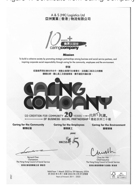
Figure 1: Certificate from Caring Company

The Group will continue to explore other means to contribute more to the environment and strive to facilitate the building of a healthy and sustainable society in the future.