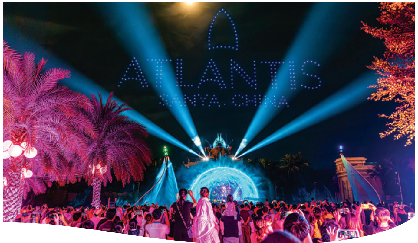
Atlantis Sanya Super Summer 2023

individual market consumption in Sanya in same period of 2022 due to the pandemic, outbound tourism partially recovered in the summer of 2023. Facing the popular trend of domestic tourism destinations such as Beijing, Shanghai, Xinjiang and Yunnan, Atlantis Sanya's performance remained strong. It recorded a Business Volume of RMB191.9 million in July 2023, representing a decrease of 10.8% as compared to the same period in 2022. The Average Occupancy Rate by Room reached 88.3% and the Average Daily Rate by Room was RMB3,007.2.