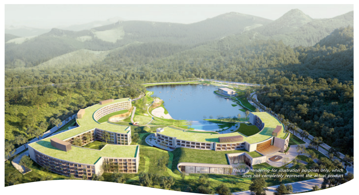
Club Med Urban Oasis Nanjing Xianlin Resort, China Liquidity refers to cash, cash equivalent, unused overdrafts and credit line.

We are seeing demand for 2023 summer season and spring of 2024 continues to gain momentum. As of 5 August 2023, the cumulative bookings for the second half of 2023, expressed in Business Volume of Stays, Tours and Services at constant exchange rate, increased by 6% compared to that for the second half of 2022 as of 6 August 2022, and increased by 21% for the second half of 2019 as of 6 August 2019, which was before the Pandemic. We are also seeing strong demand for the next ski season and spring of 2024 continues to gain momentum.