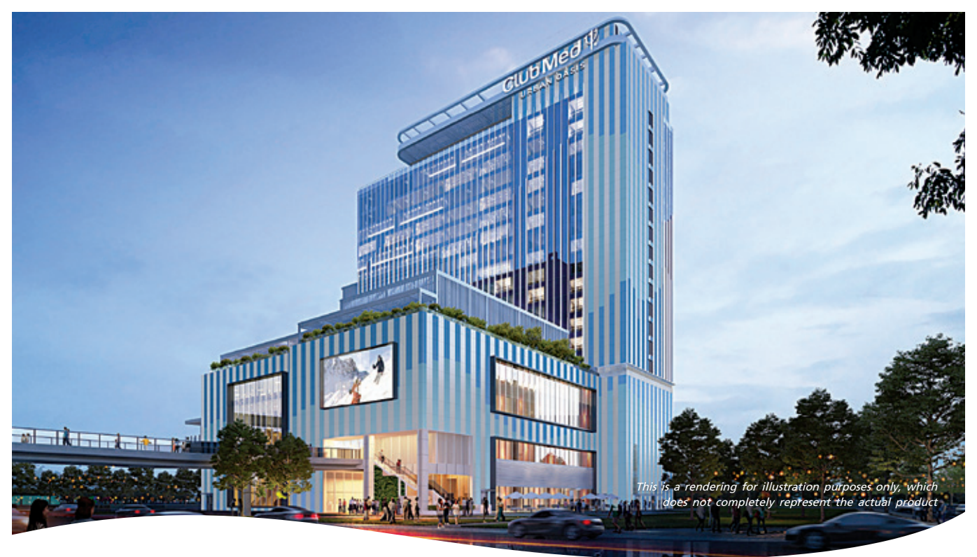
Club Med Urban Oasis Taicang Resort, China

The cumulative bookings (expressed in Business Volume of Stays, Tours and Services) for Club Med for the first half of 2024, at constant exchange rate, increased by approximately 27% compared to the cumulative bookings for the first half of 2023 as of 6 August 2022, and increased by approximately 54% compared to the cumulative bookings for the first half of 2022 as of 7 August 2021 which was during the Pandemic.