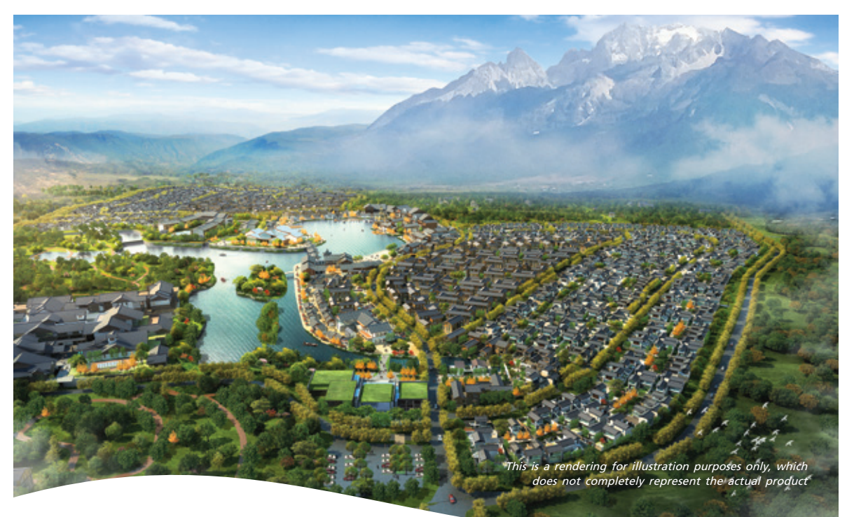
Lijiang Club Med Resort, China