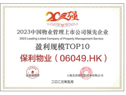
2023 Leading Listed Company of Property Management Service – Profit Scale TOP10