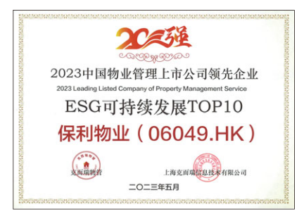
2023 Leading Listed Company of Property Management Service – ESG Sustainability TOP10

2023 Leading Listed Company of Property Management Service – Revenue Scale TOP10