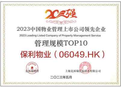
2023 Leading Listed Company of Property Management Service – Management Scale TOP10