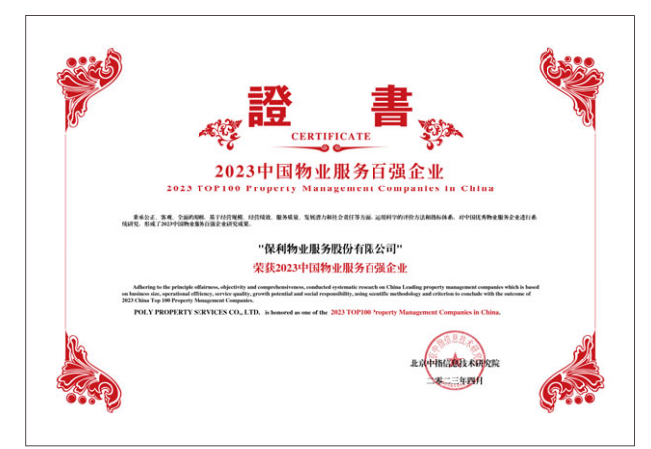
2023 TOP100 Property Management Companies in China (Top3)