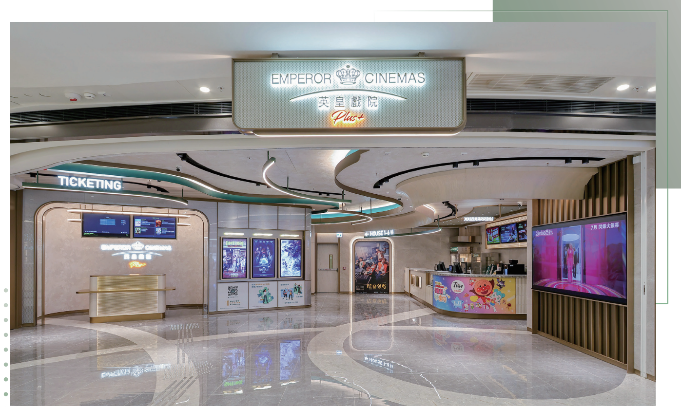
Emperor Cinemas Plus+ — The Wai, Tai Wai Emperor Cinemas Plus+ — 大圍圍方

隨著中國內地可支配收入及生活水平的不斷提高,休閒消費還有進一步發展的空間;加上國家電影局制定的五年計劃,本集團對電影放映市場的前景保持樂觀。憑藉其歷史悠久的 英皇 品牌,本集團將繼續加強其核心競爭力,以把握機遇並為其股東帶來可持續的回報。