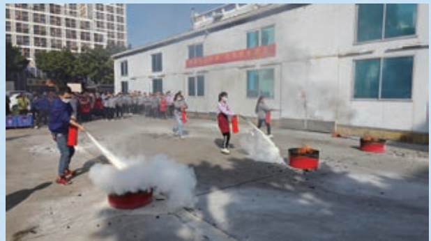
Safety production training and fire drill in the Group's subsidiary, Guangzhou Artdeco 集團下屬廣州亨雅公司安全生產培訓消防演練