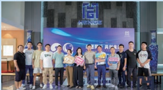
20th anniversary celebration of the Group's subsidiary, Suzhou Henge 集團下屬蘇州亨冠公司20週年慶祝活動