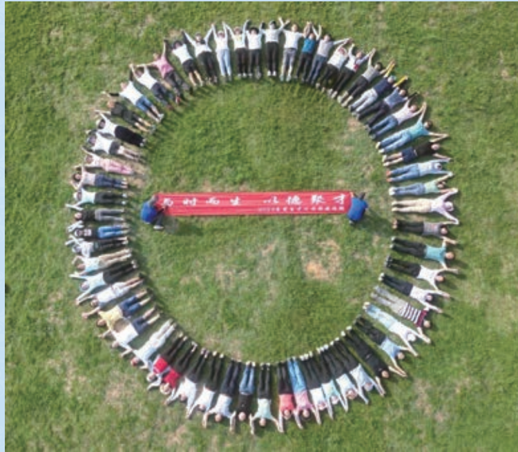
Team building activity of the Group's subsidiary, Dongguan Born Talent 集團下屬東莞生才公司員工團隊建設活動