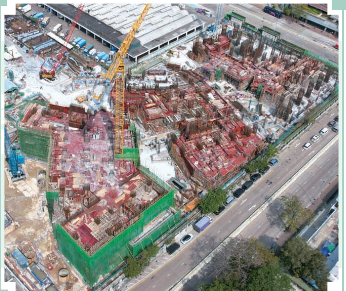
Construction of Public Housing Development at North West Kowloon Reclamation Site 1 (East)