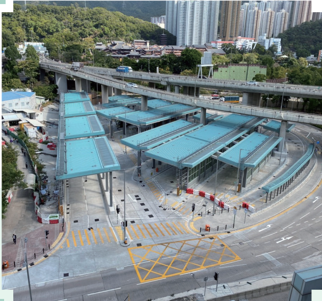
Non-Public Housing Facilities at Diamond Hill CDA — Transport Infrastructure Works, Water Feature Park and Landscaped Walk