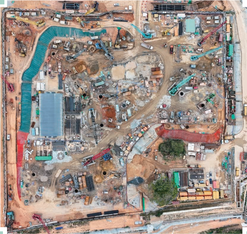
Design and Construction of Public Housing Development at Kwu Tung North Area 19 Phase 2