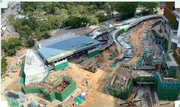
Site Formation and Infrastructure Works for Development at Kam Tin South, Yuen Long — Advance Works