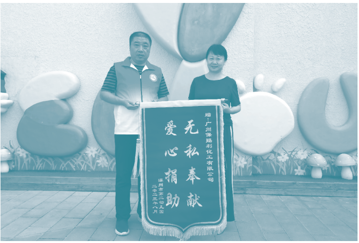
August 2023 -Donation of Disinfection and Epidemic Prevention Supplies for Post-Disaster Reconstruction in Hebei

During the Reporting Period, in the spirit of promoting the noble cause of voluntary blood donation—a selfless act of charity that contributes to societal welfare—we believe that donating blood not only benefits the physical and mental health of the individual but also helps in spreading warmth and kindness within the community. In addition, as a compassionate enterprise, we are keenly aware of our social responsibilities. Our contribution to the donation of disinfection and epidemic prevention materials in the aftermath of the Hebei disaster is a testament to the profound altruism and proactive stance of our company, reflecting our deep-rooted commitment to giving back to society in times of need.