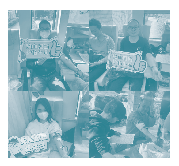
February 2023 -Voluntary Blood Donation

As a socially responsible company, the Group is committed to understanding the needs of the communities in which we operate. The Group strives to develop long-term relationship with our stakeholders and seek to make contributions to programmes that have a positive impact on community development. The Group has always been philanthropic and strives to be a good corporate citizen, with an aim to create a harmonious and well-off society. The Group encourages employees to participate in community service, supports those in need through donations and attending charity events, and also hopes to foster the new generation of young people's positive thinking, such as the sense of responsibility to society.