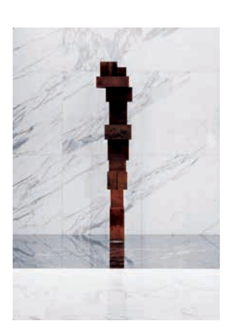
Antony Gormley Shrive XV (Twisted)