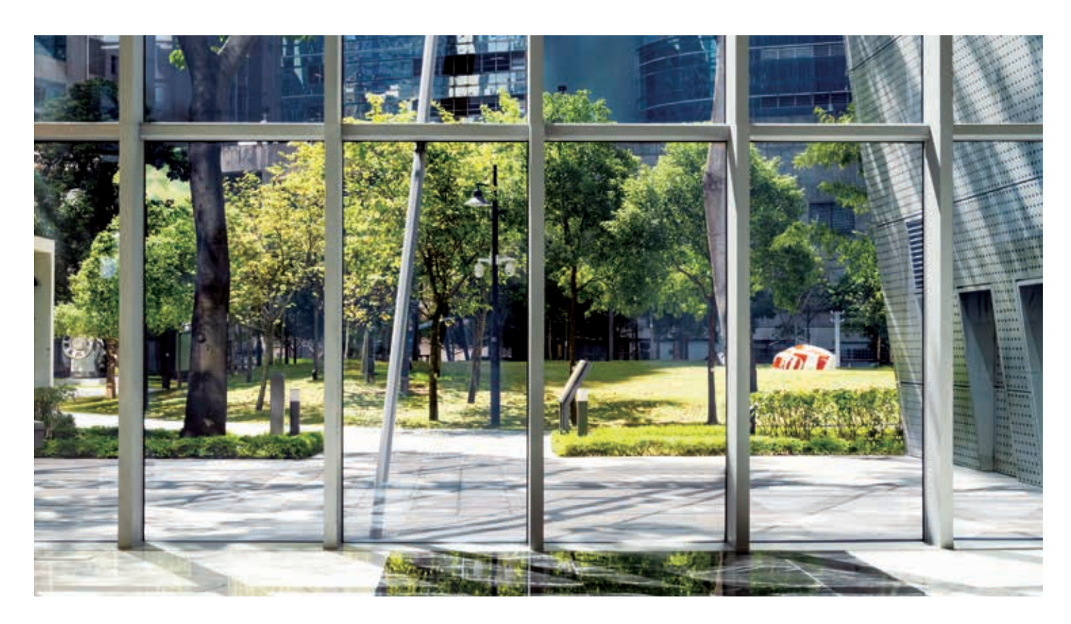
All photos in this annual report were taken at Landmark East, Kwun Tong. 本年報所有圖片均攝於觀塘 Landmark East。