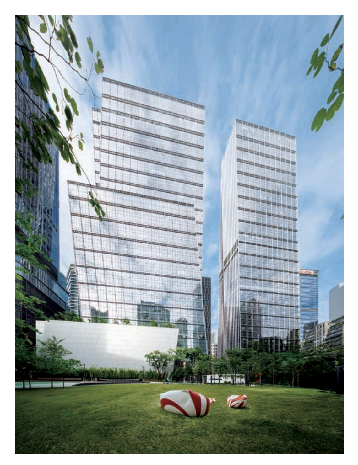
Landmark East has obtained LEED and BEAM Plus Platinum rating in 2023.