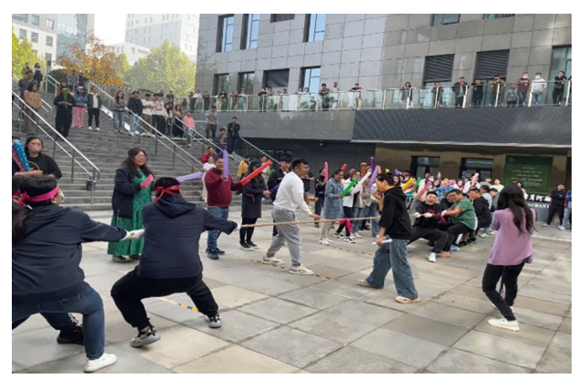
Tug of War