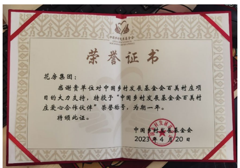
The title of "2023 China Rural Development Foundation Caring Partner" was awarded by The China Rural Development Foundation