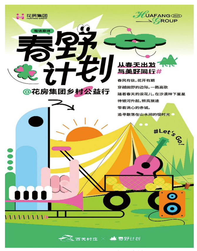
"Spring Wild Project (春野計劃)"

The first phase project was launched in April 2023 in the northwest of Dongxiang Autonomous County, Linxia Hui Autonomous Prefecture, Gansu Province and the second phase project was launched in Gannian Village, Guang'an District, Guang'an City, Sichuan Province in May 2023. The projects were mainly carried out in the form of countryside concert, slow live broadcast and promotional video, which can convey their warm to impoverished areas, promote the local culture and tourism characteristics, and let more people to feel the passion.