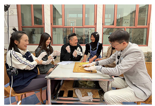
The first phase project – launched in the northwest of Dongxiang Autonomous County, Linxia Hui Autonomous Prefecture, Gansu Province in April 2023