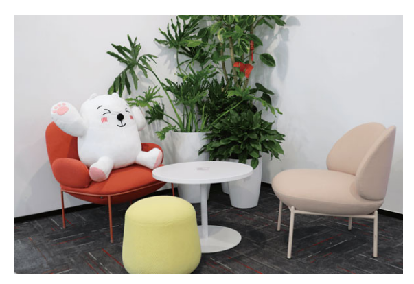
Comfortable Office Environment