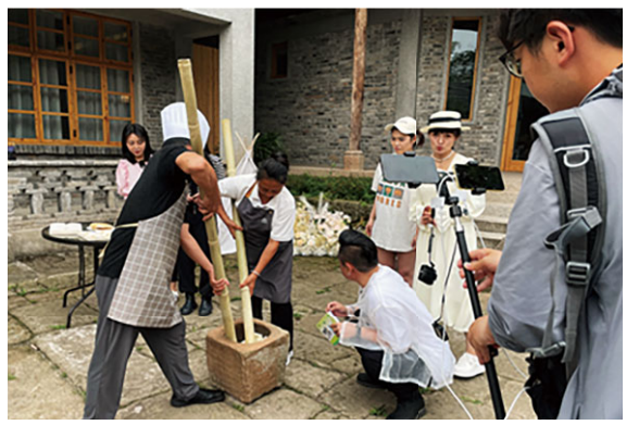
The second phase project – launched in Gannian Village, Guang'an District, Guang'an City, Sichuan Province in May 2023