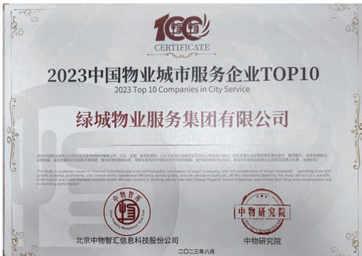
2023 Top10 Companies in City Service Enterprises 2023 中國物業城市服務企業Top10