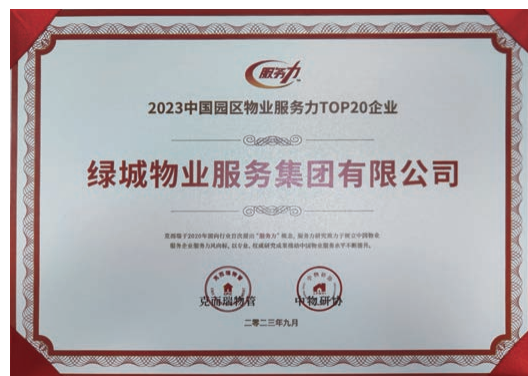
2023 China Park Property Service in Top20 Enterprises 2023 中國園區物業服務力Top20 企業