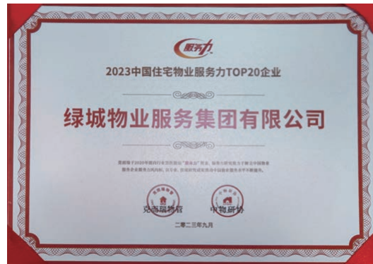
2023 China residential Property Service power Top20 Enterprises 2023 中國住宅物業服務力Top20 企業