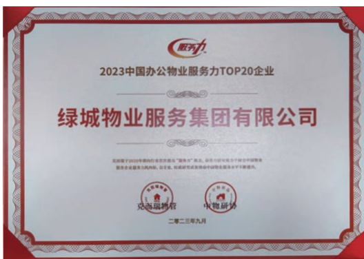
2023 China Office Property Service power Top20 Enterprises 2023 中國辦公物業服務力Top20 企業