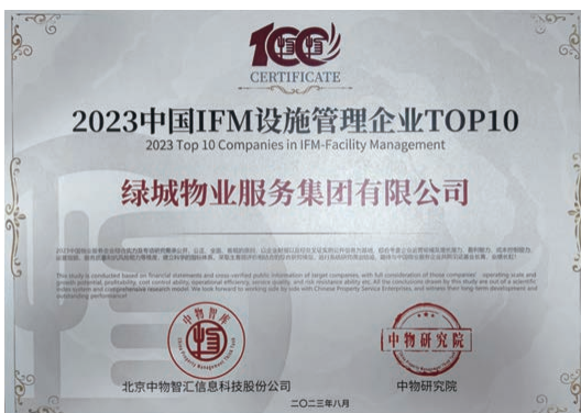
2023 Top10 Companies in IFM-Facility Management 2023 中國 IFM 設施管理企業Top10