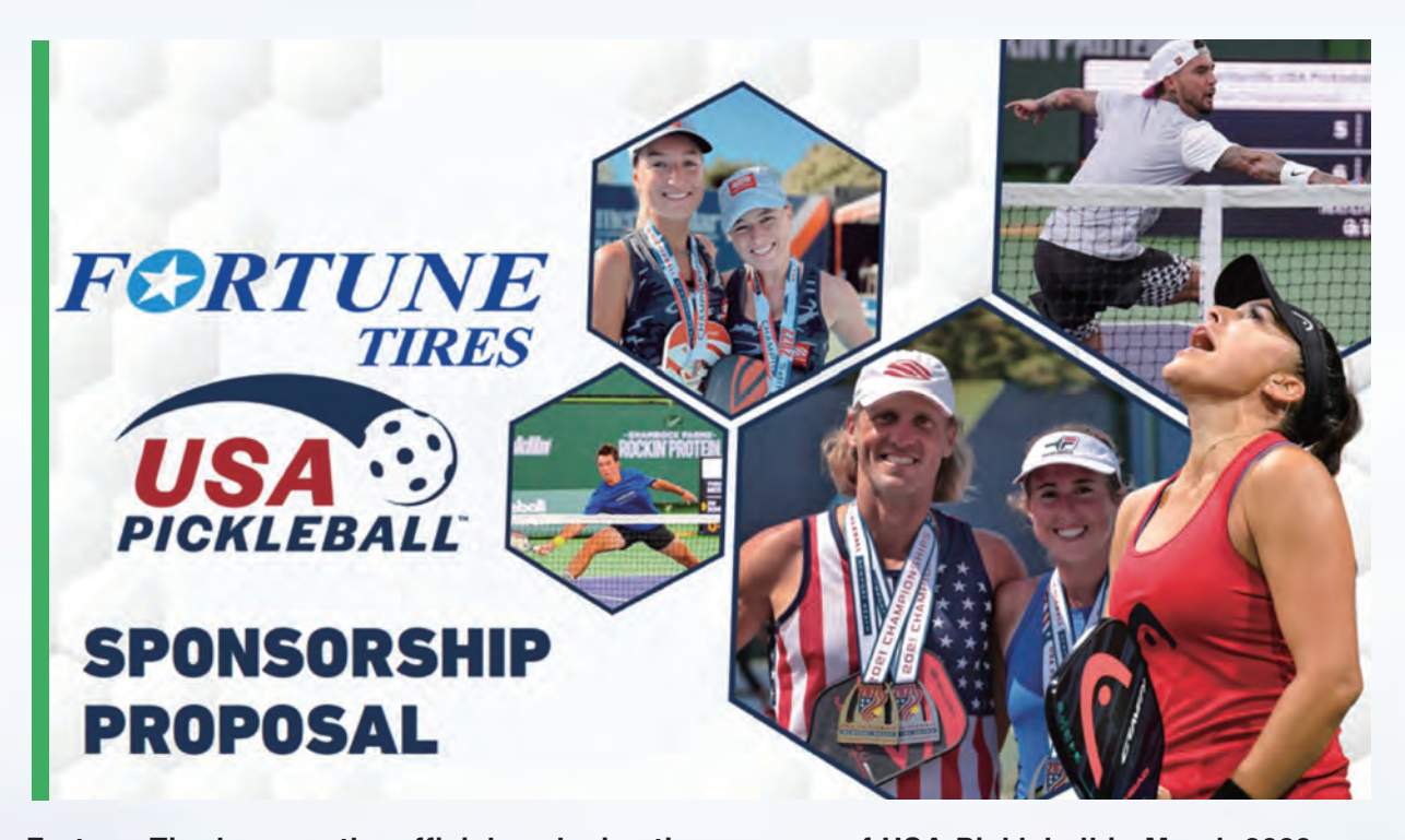
Fortune Tire became the official exclusive tire sponsor of USA Pickleball in March 2023

In 2023, Prinx Chengshan's North America Branch entered into a cooperation with USA Pickleball, a pickleball league in the United States. Fortune Tire, a tire brand under Prinx Chengshan, became the official exclusive tire sponsor of USA Pickleball. Since its entry into the U.S. market in 2019, Prinx Chengshan Fortune Tire has continuously advanced its technological innovations to provide high-quality tire solutions with comprehensive performance for North American users, leading to a sustained increase in brand influence in North America. With Prinx Chengshan's accelerated global market layout the introduction of a new international product portfolio, and the unveiling of its brand image, Fortune Tires' brand concept of "Driving Forward" is also establishing a deeper connection with North American users. In addition to providing users with safe, high-quality and high-performance tire solutions, Fortune Tire has also become a promoter of an active lifestyle.