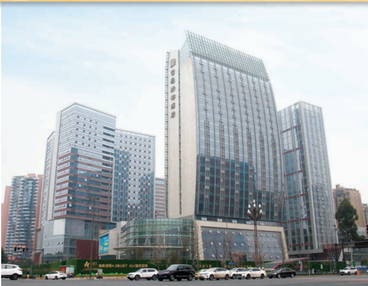
Regal Cosmopolitan City - Regal Xindu Hotel and commercial/office towers