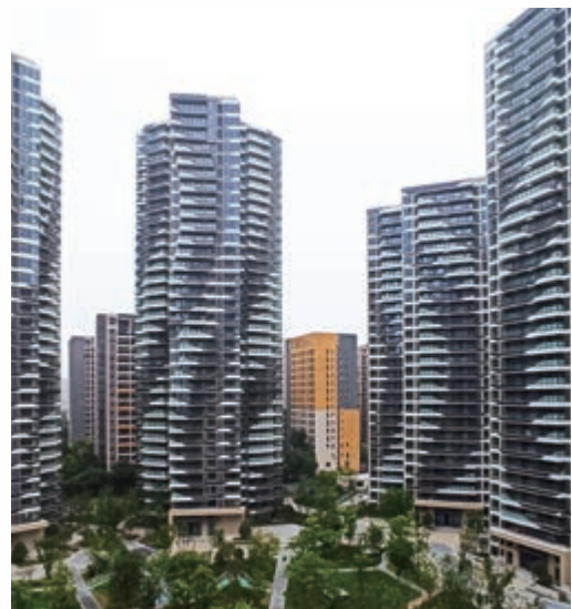
Casa Regalia (Phase 1 and Phase 2), Regal Cosmopolitan City - completed