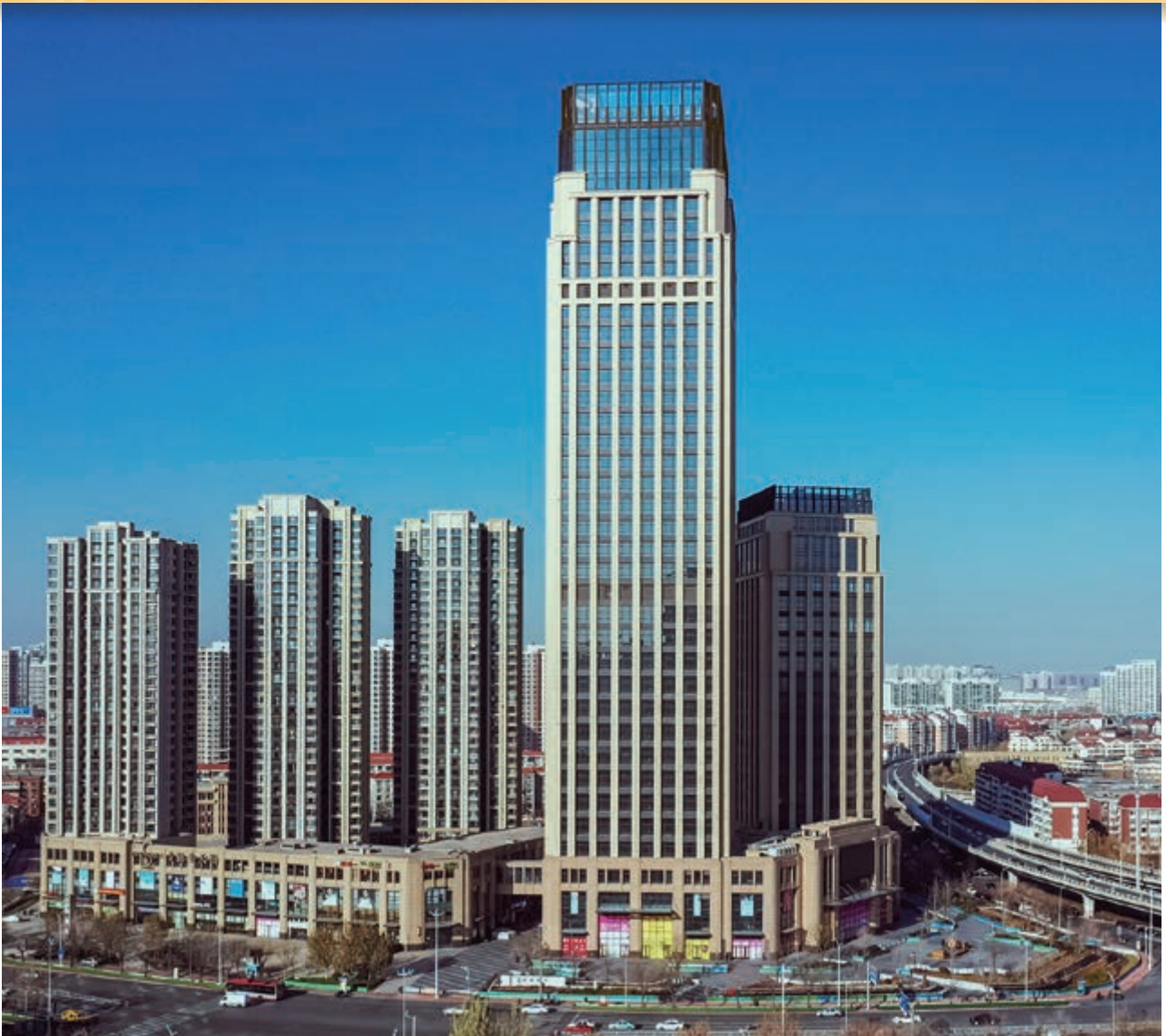
Regal Renaissance, a composite commercial/office/residential development in a prime location of Hedong District, Tianjin