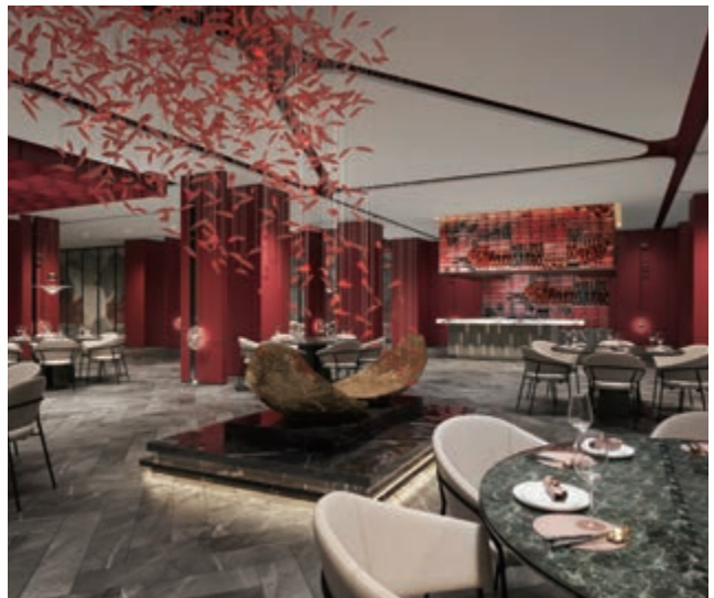
Chinese restaurant at Regal Xindu Hotel (*)