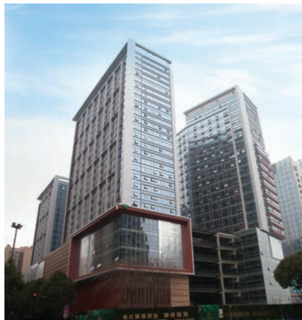
Regal Xindu Hotel and commercial/office towers - building and facade works completed