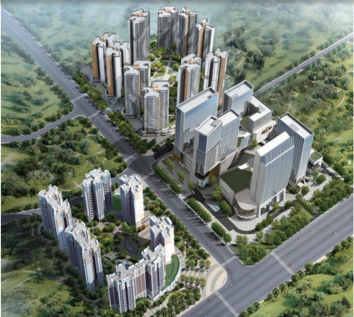
Regal Cosmopolitan City, a composite residential/commercial/office/hotel development in Xindu District, Chengdu, Sichuan (*)