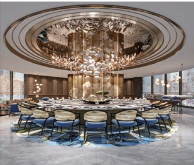
Private dining room at Regal Xindu Hotel (*)