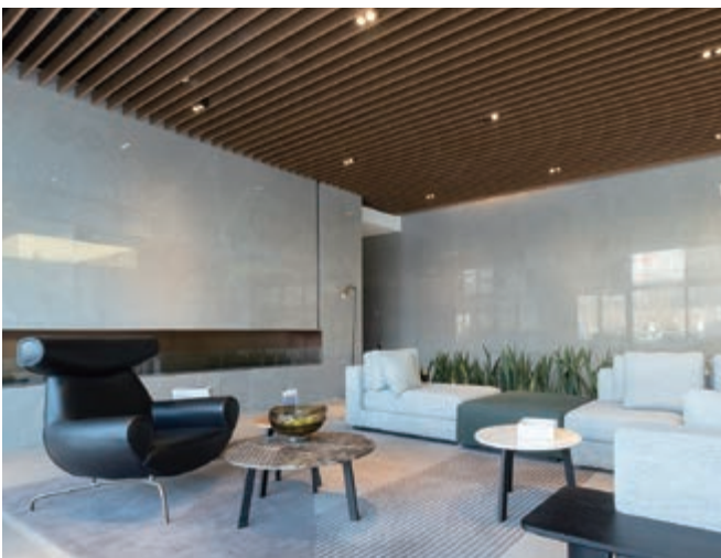
Lobby of an office tower