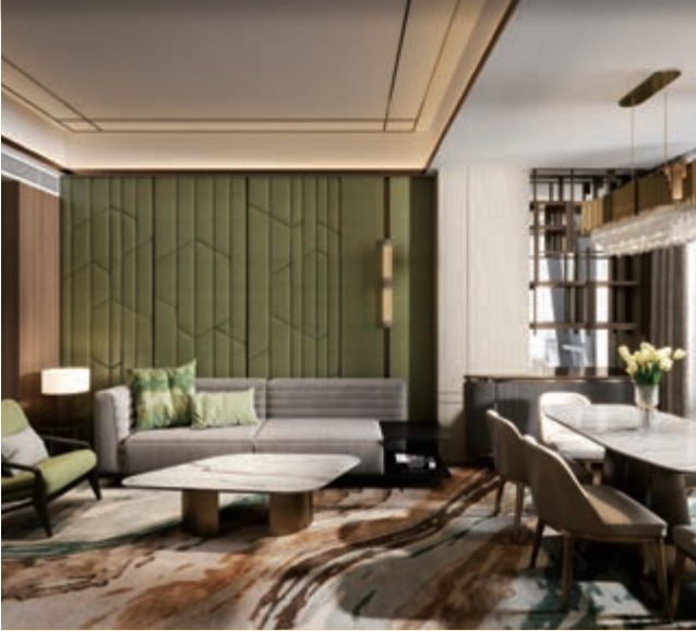
Guestroom suite at Regal Xindu Hotel (*)