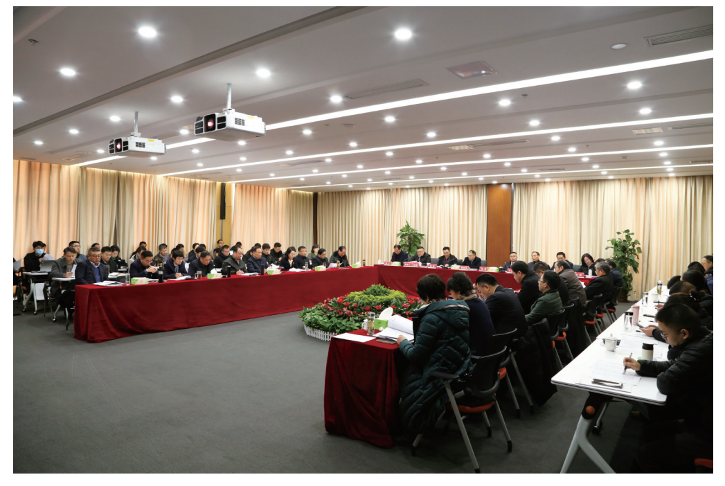
Integrity Education Provided for Directors and the Management

The Group is committed to creating an honest and equitable business environment, and advocates combating corruption, upholding integrity and fair competition among all employees. We provide all directors and employees of the Company with integrity education, and consistently reinforce the publicizing and implementation of the regulations. During the Year, with a focus on financial management, procurement management, project management, legal affairs and other aspects, the Croup held special sessions and case-based training to deepen employees' understanding of anti-corruption efforts, enhance their awareness and ability of maintaining honest in their career, foster a fair, transparent and honest corporate culture, and further promote the healthy development of the Company.