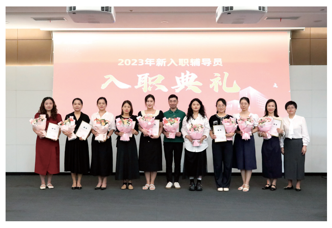
New Counselor Training and Induction Ceremony themed on "Xinhua Park Youth Navigator in Xinhua Park"

This training helped new employees obtain a thorough comprehension of their jobs, greatly facilitating their swift integration into the new work environment and accelerating their role transition and personal growth, which not only laid a strong foundation for their individual career development, but also made a significant contribution to talent cultivation and team construction within the schools.