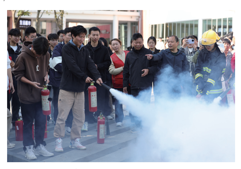
Activities in Fire Fighting Publicity Month for "Rejuvenating the Country and Serving the People through Xinhua Education" in 2023

We also carry out a number of training sessions and drills in relation to safety and fire prevention to strengthen the safety awareness of teachers and students. All of these measures represent our all-out efforts to eliminate potential safety hazards.