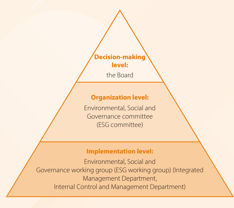
Decision-making level: the Board

YH Entertainment has established its ESG governance structure. The ESG governance structure consists of three levels, including decision-making level consisting of the Board, organization level led by senior management, and implementation level consisting of relevant departments. The organization level refers to our ESG committee led by our Executive Director and President. The ESG work is driven by various relevant departments in the Group, which will formulate more environmental and social measures. The duties and responsibilities of each level are set out below.