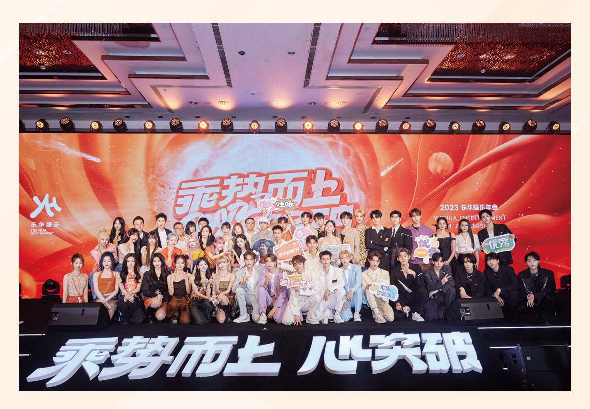
YH Entertainment Annual Party 2023