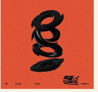
TEMPEST's music album "Into The TEMPEST (風暴之中)"