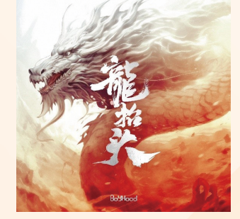
BOYHOOD's music single "DRAGON HEADS RAISING (龍抬頭)"