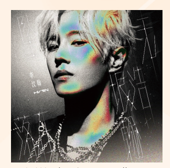
Li Wenhan's music album "FALLING OFF (墜落在無垠浩翰)"

During the Year, our managed artists participated in various types of film and television works, variety programs, and released various types of music works, which attracted extensive attention and support.