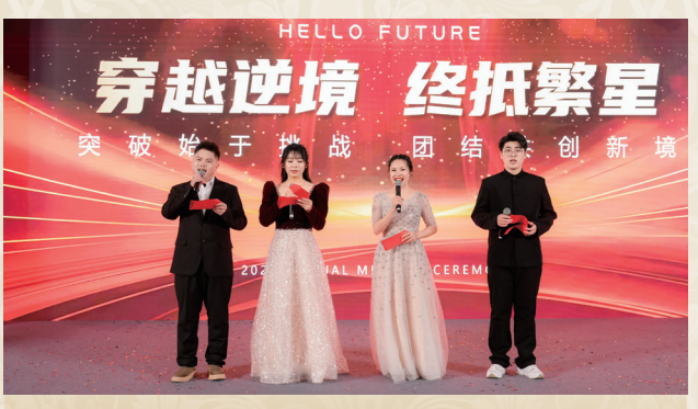
Activity of the Group's subsidiary, Suzhou Henge 集團下屬蘇州亨冠公司活動