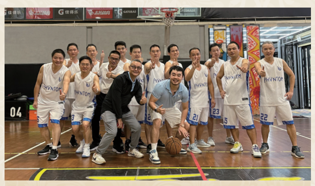
Activity of the Group's subsidiary, Dongguan Born Talent 集團下屬東莞生才公司活動