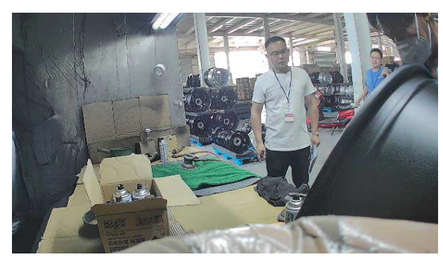
Occupational health and safety training