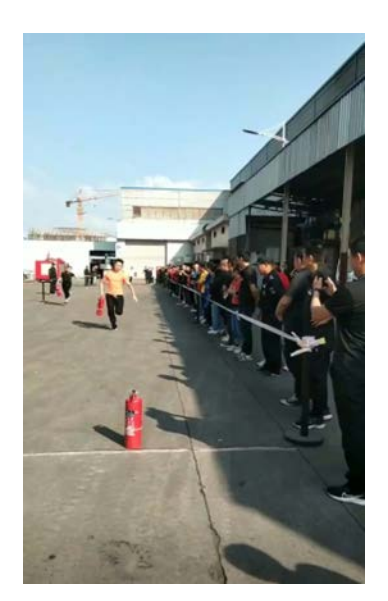
Fire safety competition