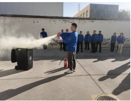
Fire Safety Drill