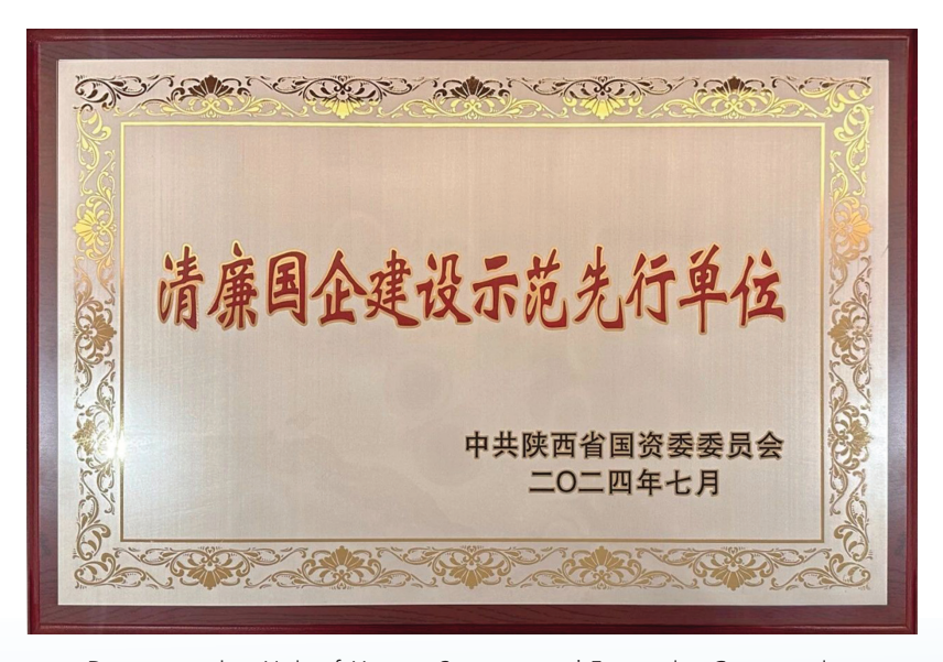
Demonstration Unit of Honest State-owned Enterprise Construction