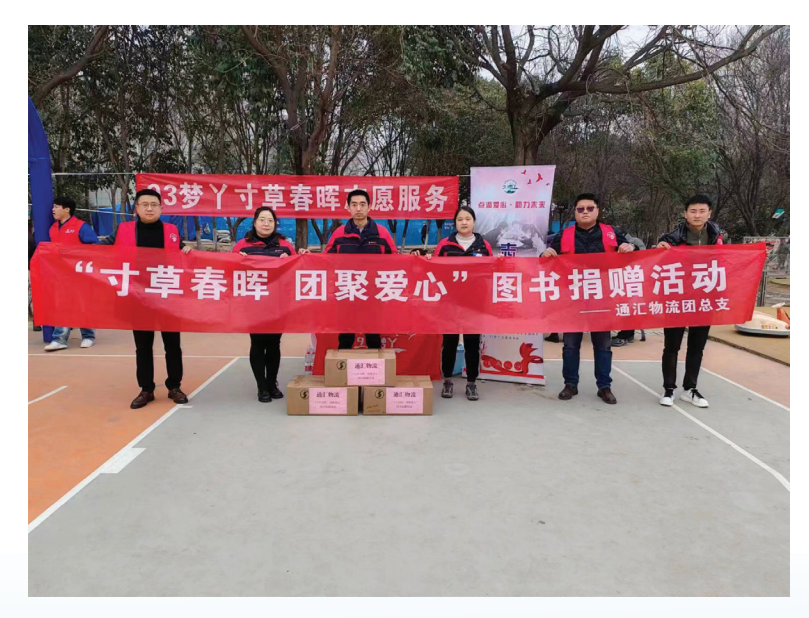
"A Little Bit of Grass Gives Light to the World and Gathering Love" Book Donation Campaign

During the year, the Tonghui Logistics organised a book donation campaign titled "A Little Bit of Grass Gives Light to the World and Gathering Love". The initiative aimed to collect gently used books donated by neighbouring communities and employees, which were then distributed to under-resourced schools, providing children with access to knowledge and hope. This effort reflects the Group's dedication to social responsibility and community contribution, embodying our commitment to fostering a more equitable and compassionate society.