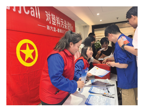
Employees Actively Applying for Volunteers

On 22 April 2024, the Group organised a community clean-up volunteer activity in response to the World Environment Day. Employees enthusiastically participated in the activity, working together to clean up the neighbourhood and contributing to creating a cleaner, healthier living environment. This voluntary activity not only demonstrates the Group's concern for environmental protection, but also units the spirit of teamwork and shows the Group's care for the community and the environment.