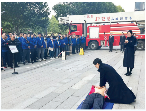
Fire Safety Knowledge Training