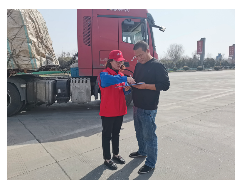
End User Satisfaction and Demand Survey

For customer complaints, the Group will, in principle, accept and review the complaint within 3 working days. Every accepted complaint will be sort within 30 business days. During the Year, the Group received a total of 8 complaints, and have all been resolved in accordance with the "Customer Complaints and Dispute Resolution System."