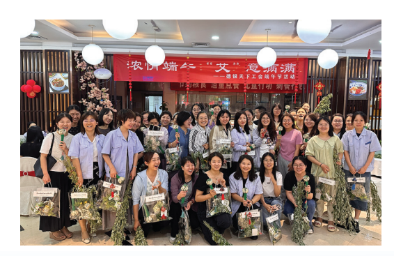
Cultural Embrace Dragon Boat Festival Celebration