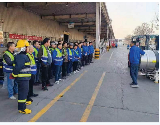
Safety Emergency Drill