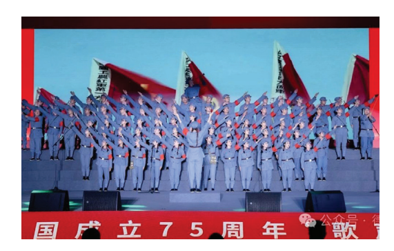
National Day Resounding Songs Celebration