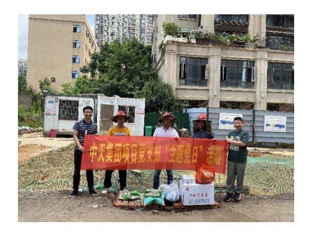
The Group provided refreshing beverages to community service personnel