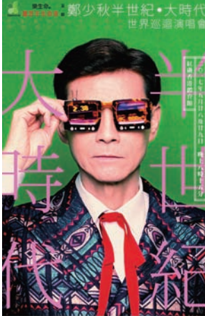
28-29 May 2017 at 20:15 紅斑海道智慧 mm HK$780/HK$480/HK$2 行果現社場合書単約2回9音

As at 31 July 2017, the Group had 210 (as at 31 July 2016: 184) employees. Staff costs, including directors' emoluments for the year ended 31 July 2017, amounted to approximately HK$98,705,000 (2016: approximately HK$92,504,000). The Group's remuneration policy is basically determined by the performance of individual employees. In general, salary review is conducted annually. Staff benefits, including medical coverage and provident funds, are also provided to employees.