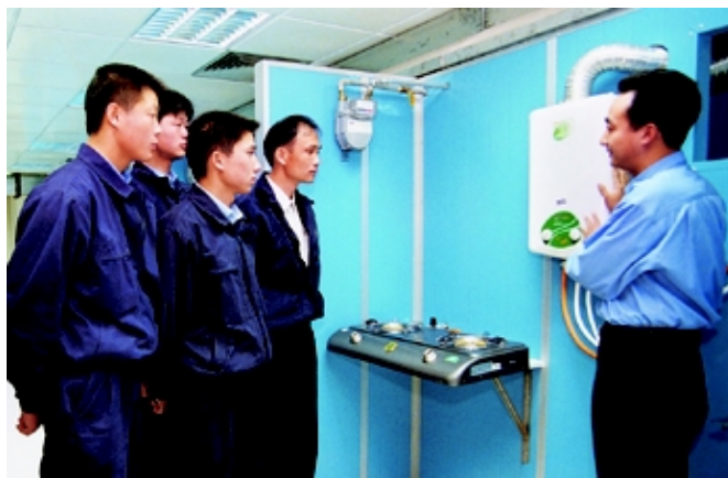
The Guangdong Towngas Technical Training Centre situated in Guangzhou Dongyong provides comprehensive gas training to upgrade the local standards of professionalism.

Our gas business for Zhongshan, Panyu and the Guangzhou Economic and Technological Development Zone grew 88 per cent because of a substantial growth in gas consumption — driven largely by recovery in the respective property markets and the resulting investments. The total number of customers now exceeds 25,000 and that figure is still rising. As these cities and industrial zones expand and become sizable economies, our gas joint ventures are also becoming model city gas operations. The Group will benefit from this growth as it continues to develop its gas business in the mainland.