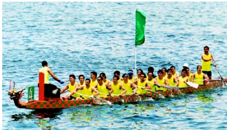
Our Dragon Boat Team wins the championship in open competitions.