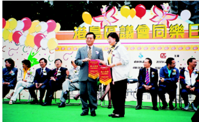
A District Council Focus Team member receives a souvenir for the Company's support at the Hong Kong Island District Councils Day.

The Towngas team was the first runner-up in the Tai Po Dragon Boat Races — Industrial Category, and second runner-up in the Chai Wan Fishermen's Recreation Club Trophy Dragon Boat Race for Groups and Organisations at the Millennium Eastern District Dragon Boat Races. Participation in these races helped to foster teamwork within the organisation, while at the same time cultivating a strong spirit of working together to achieve a common goal.