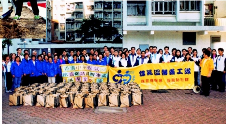
Towngas Voluntary Team delivers long-boiled soup to the elderly living in housing estates.

For the sixth consecutive year, we were presented with the Community Chest President's Award. For nine years, we have secured the Platinum Award and Top Fund-Raiser Award in the Corporate and Employee Contribution Programme, as well as the Highest Donation Award and the Highest Participation Rate Award in the Companies and Organisations Category. The Group also maintained its fine tradition of matching employees' contributions on a dollar-for-dollar basis. Our continued support for the Community Chest has raised the Company's profile in the community.