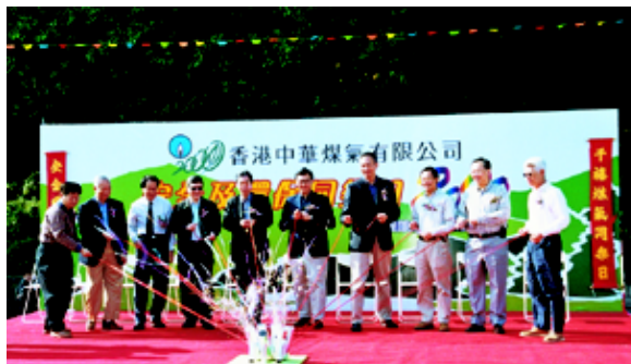
Towngas organises the Safety and Environmental Protection Day to arouse the safety and environmental awareness of its employees and their families.

Other major sponsorship programmes during the year included the Hong Kong Philharmonic Society's "Music and Wellness", the Tung Wah Group of Hospitals' donation campaign, and the establishment of a Demonstration Kitchen for the Vocational Training Council's Chinese Cuisine Training Institute.