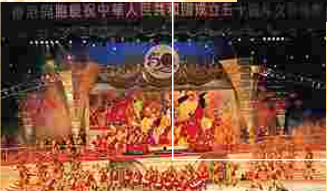
Hong Kong Fashion Extravaganza "Movie Queens" – Pre-show Theme Party