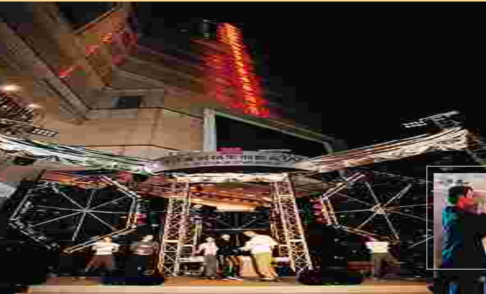
Times Square Apple Countdown 2001