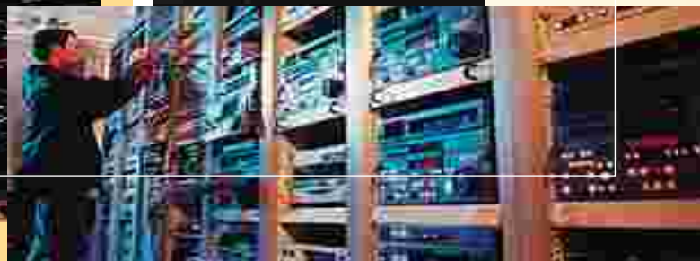
Wellfit Group's Video Tape Recording Facilities

Wellfit Group was acquired by CCT Multimedia in November 2000 as part of our long-term development plan to become an all-round media and production operation.