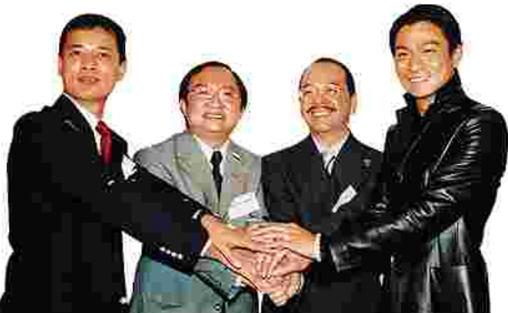
CCT Multimedia and Wellfit Group celebrate the new union

As one of Hong Kong's leading producers of such a wide range of multimedia content, Wellfit Group's operations and market strengths will contribute to CCT Multimedia's future in the industry.