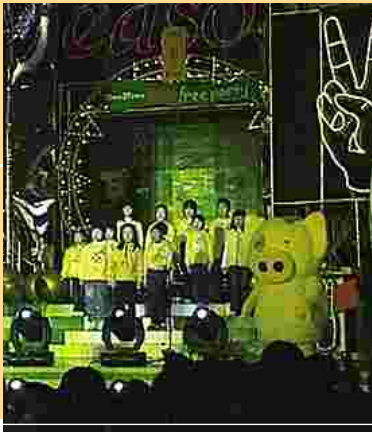
One2Free Christmas Free Party on Canton Road