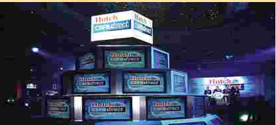
Hutch CSFB direct Media Conference & Launch Party