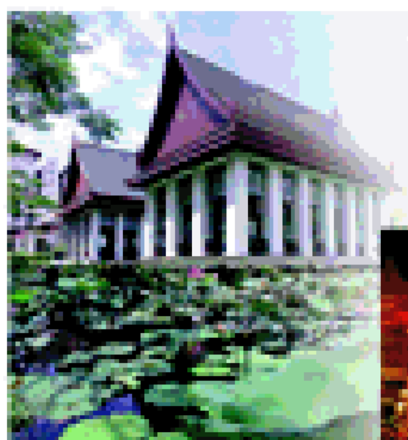
曼谷 The Sukhothai 酒店的 Celadon 泰國餐廳屢獲殊榮 Celadon, the celebrated Thai restaurant at The Sukhothai