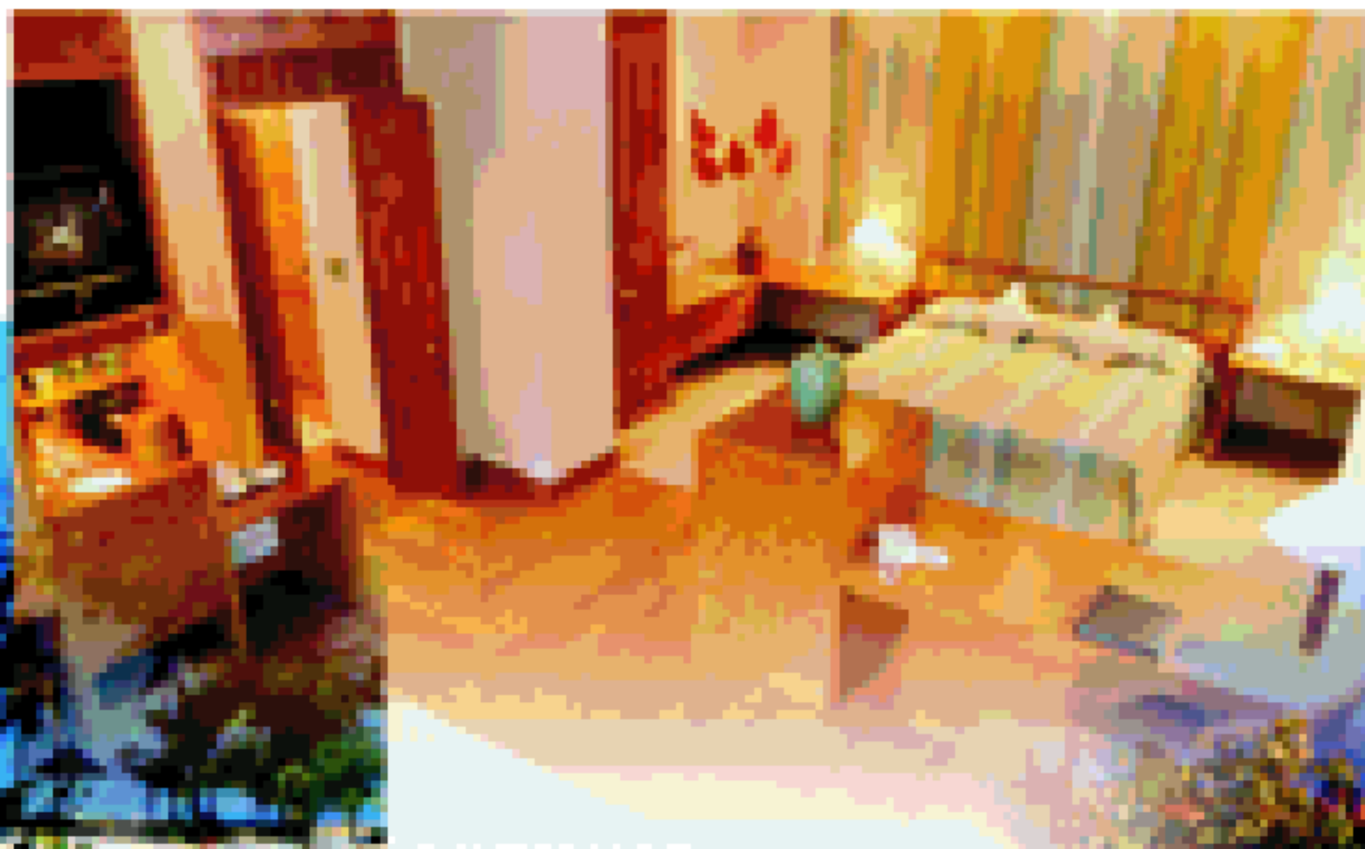
新加坡百富酒店及會議中心的華麗套房 A junior suite of The Beaufort Hotel and Conference Centre