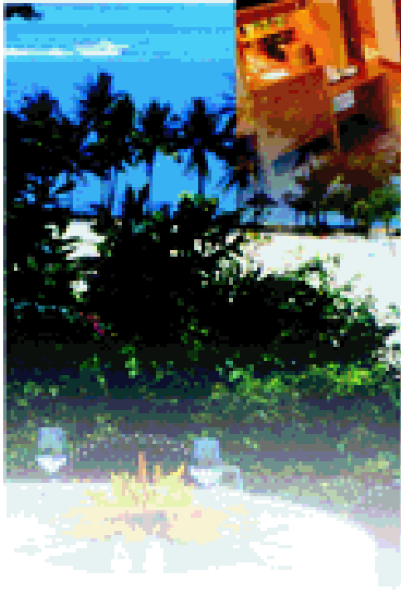
新加坡百富酒店及會議中心飽覽Tanjung 沙灘的秀麗風景 The Beaufort Hotel and Conference Centre in Singapore overlooking Tanjung Beach