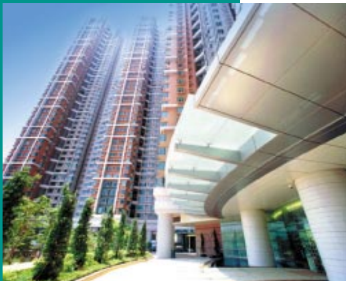
Both The Belcher's in western Mid-Levels (top) and Ocean Shores in Tseung Kwan O, received high acclaim from owners for their superb quality.