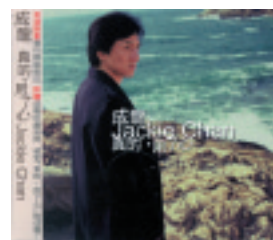
Jackie Chan's Mandarin album

During the year, the Group used its best endeavour in disposing of its non-core assets and consequently reduced its finance costs significantly.