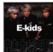
Artiste group E-kids