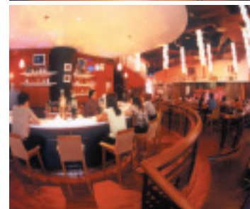
Star East, Macau