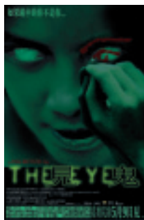
Movie "The Eye"