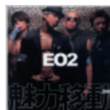
Artiste group EO2