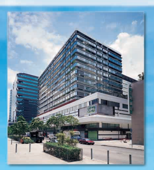
Harbour Crystal Centre, Tsimshatsui East Kowloon

Harbour Industrial Centre, Ap Lei Chau, Hong Kong