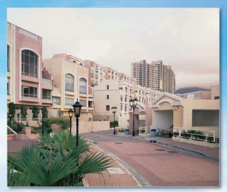
The Red Hill, Tai Tam, Hong Kong

Oceanic Industrial Centre, Ap Lei Chau, Hong Kong