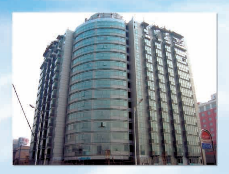
The residential building erected on Lot No. 9 of the Xidan Project